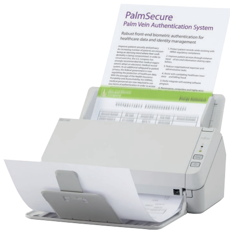
Dependable day to day scanning