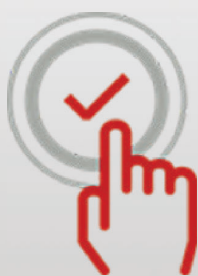
One touch operation

Market-leading technology, over 50-years experience and a reputation for quality and reliability have made Fujitsu the world's most trusted scanner brand.