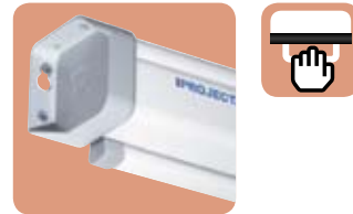
The most compact case.