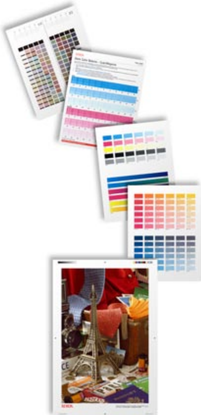
Built in colour calibration tools give you the final output you want.