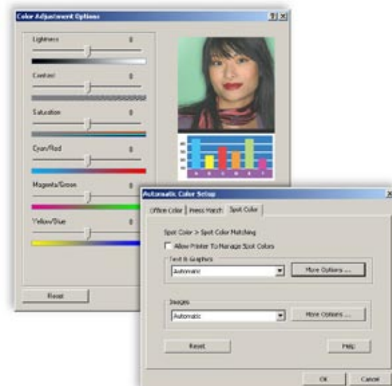
Advanced colour tools allow you to fine-tune output to your specifications.