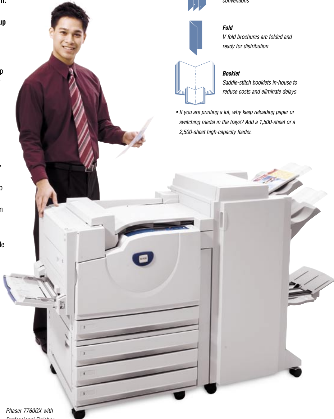
Phaser 7760GX with Professional Finisher