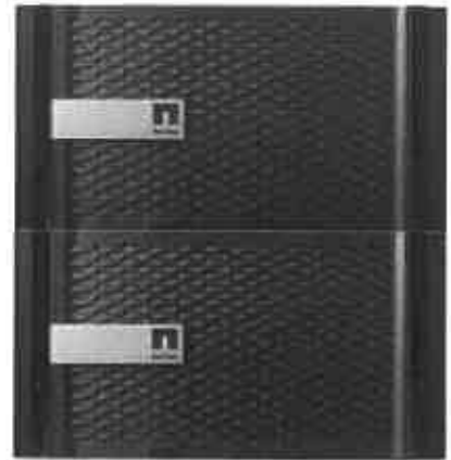
Figure 2) FAS8080 EX controllers.

For maximum flexibility, Cloud ONTAP provides superior data portability at the best ROI. Cloud ONTAP is a software-defined storage version of Data ONTAP that runs in AWS and provides the storage efficiency, availability, and scalability of Data ONTAP. It allows quick and easy movement of data between your on-premises FAS8000 and AWS environments with NetApp SnapMirror® data replication software.