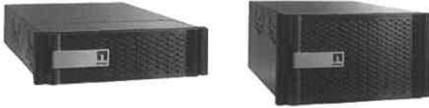
Figure 1) NetApp FAS8000 controllers.