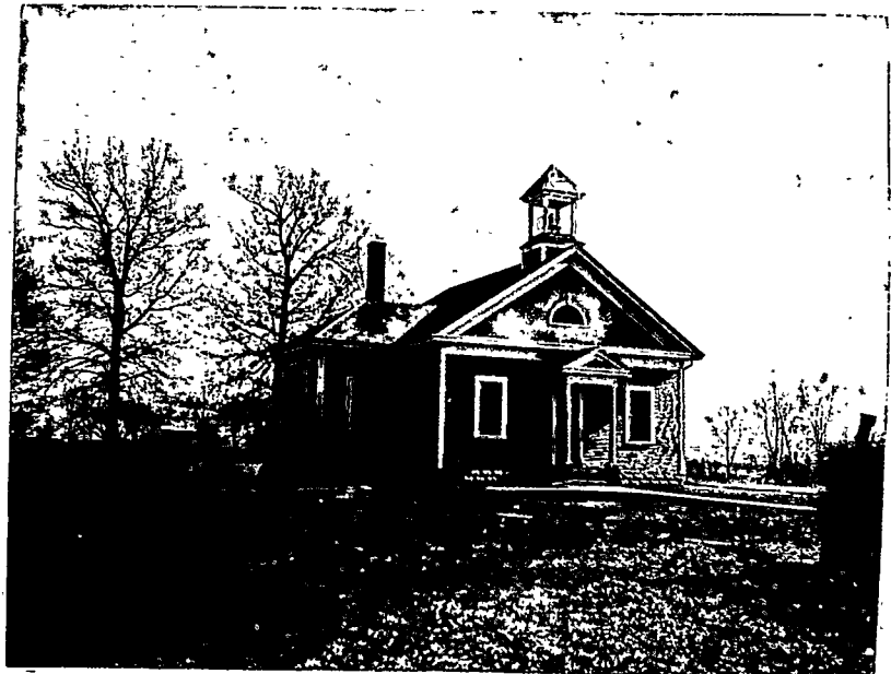
Rural School, Dist. 72, Macoupin County. View of front or west end, and north side.