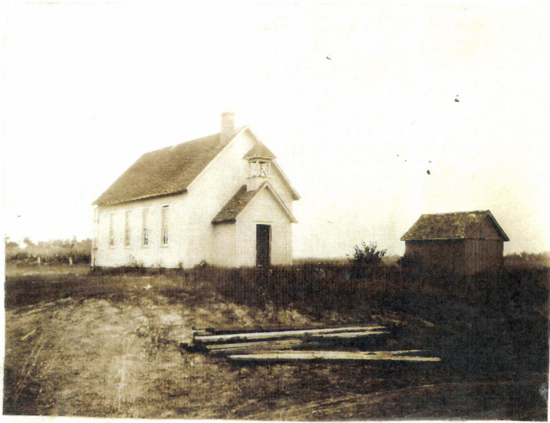
Mt. Ragan, No. 64, 11-9