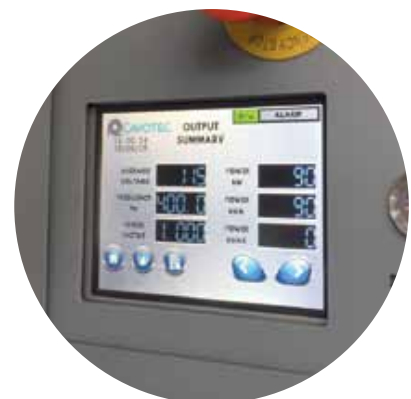
Cavotec Skyway Interface