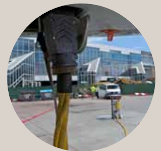
400Hz aircraft Plugs