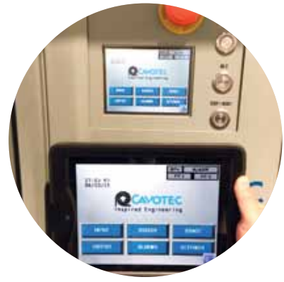
Remote monitoring with Smartphones and tablets