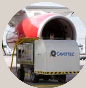
400Hz Power Converter Caddy