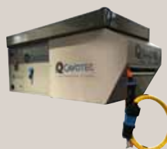
Series 2500+ PowerPack I-Connect