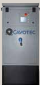
Series 2500+ Vertical ground mounted