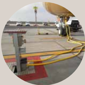
400Hz Pop-up Pit