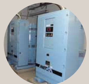
400Hz Centralized MGs