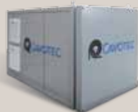
Series 2500+ Horizontal PBB mounted