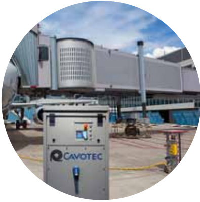
3G and NGA Ready