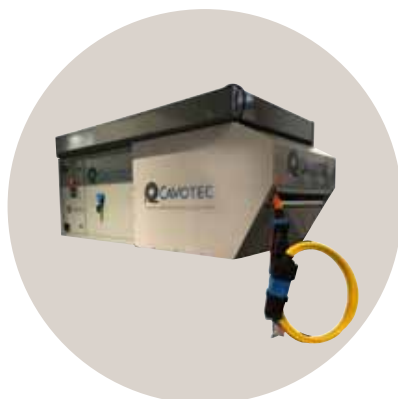
Series 2500+ PowerPack I-Connect

Clean, reliable and sustainable 400Hz power.