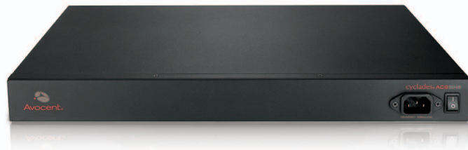
ACS 5048 Advanced Console Server

The ACS 5000 console server decreases network maintenance costs and helps maximize IT asset productivity while providing scalability, making it the right choice for secure in-band and out-of-band management for medium to large enterprise data centers.