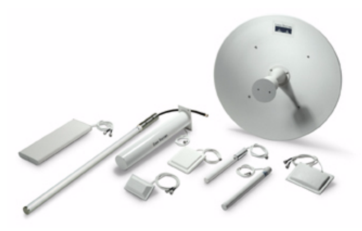
Figure 1 Cisco offers a complete range of 2.4 GHz antennas for client adapter, access point, and bridge equipment that enable a customized wireless solution for almost any installation.

Cisco is committed to providing not only the best access points, client adapters, and bridges in the industry—it is also committed to providing a complete solution for any wireless LAN deployment. That's why Cisco has the widest range of antennas, cable, and accessories available from any wireless manufacturer.