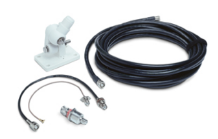
Table 5 Cisco Aironet Accessory Features

To complete an installation, Cisco provides a variety of accessories that offer increased functionality, safety, and convenience. (See Table 5.)