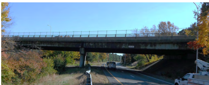
East Ave West