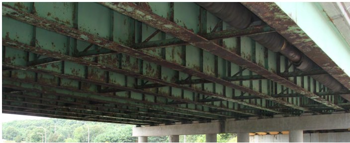
East Ave West