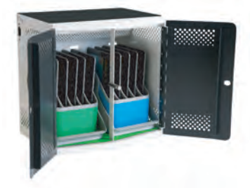
iQ 10 Charging Station™