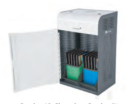
Carrier 10 Charging Station™

LocknCharge Carrier Carts are designed to work with almost any device. Equipped with Large Baskets by LocknCharge, Carrier Carts are compatible with smaller tablets, right up to a 13" Chromebook. And if you decide to go bigger, a device rack is available that caters for devices up to 17" in size.