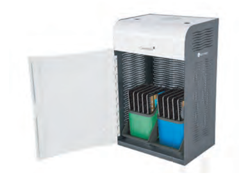
Carrier 10 Charging Station™

Specifications and images are for illustration purposes only. Final product may differ. The Tablet device must support USB syncing and charging functionality. Visit www.lockncharge.com for more details.