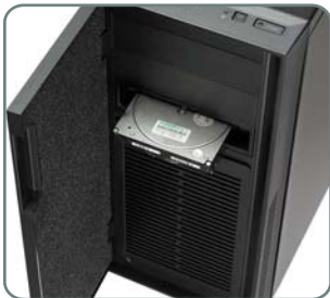
■ External SATA X-dock