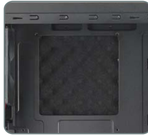
■ CPU retaining hole for easy customizability