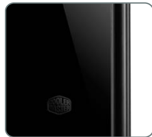
■ Mirror Finish Front Panel