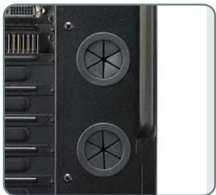
■ Rear retaining hole for water cooling kit