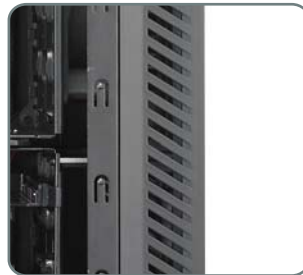
■ Ventilation Design