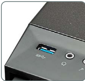
■ USB 3.0 (USB 2.0 backwards compatibility)