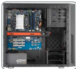
■ Supports Long VGA such as AMD HD 6990 and NVIDIA GTX 590 (without HDD cage)