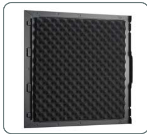
■ Side panel and front door with sound proofing