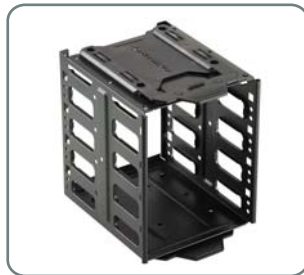
■ Removable HDD cage