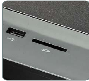
■ High Speed SD card reader