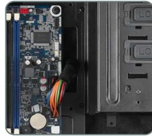
■ Improved cable management