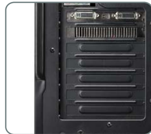
■ 7 expansion slots