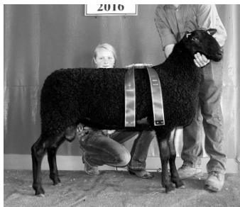
Stoltman Family, KY Reserve Champion Ram sold to Bear Hollow Farm, OH.

Lot 164 Spring Ewe Lamb Information Sale Day S-T Deakin We will select a top futurity nominated ewe lamb from our mid-February lambs.