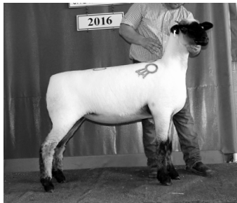
Grand Champion Hampshire Ewe bred by Double Bar D, OH and sold to Royal Hamps, NY.