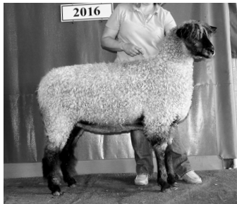
National Grand Champion Natural Colored Lincoln Ewe bred by Wyncrest, MO and sold to Kay Stadel, KS.

Lot 232 Ewe Lamb Entry Information Sale Day