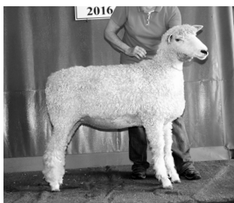
Boersma Ranch, IL National Grand Champion Ewe sold to Sophie Larson, WI.

Lot 207 Spring Ewe Lamb Information Sale Day Both ewe lambs will be Futurity nominated and picked from our top show lambs.