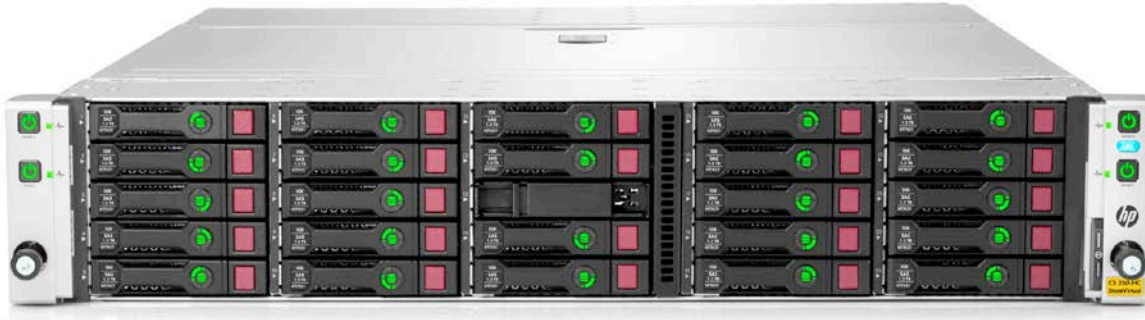
Chassis, front view with 24 drives