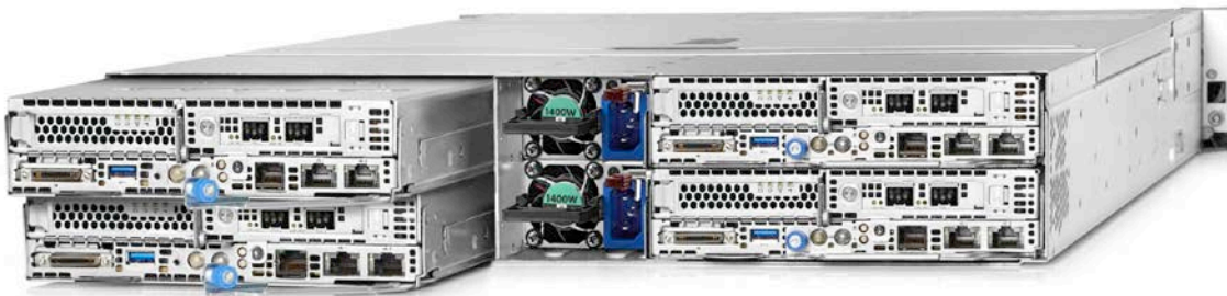
Chassis, back view with 4 nodes