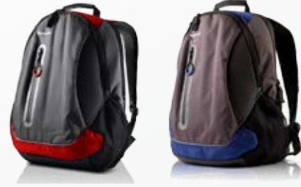
Lenovo® Sport Cases (Backpack/Slimcase/Messenger)