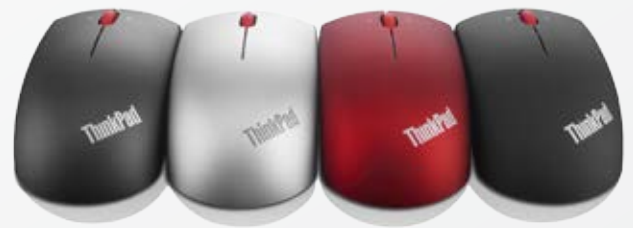
ThinkPad Precision Wireless Mouse - Midnight Black 0B47163; Heatwave Red 0B47165; Frost Silver 0B47167; Graphite Black 0B47168