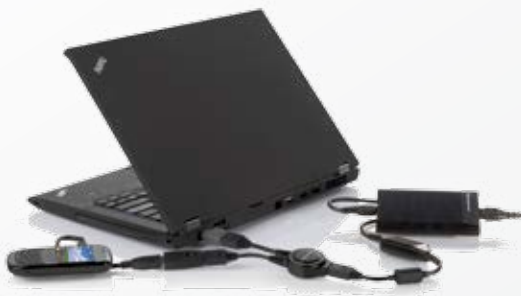
Lenovo 90W Ultraslim AC/DC Combo Adapter (41R44xx)