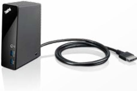
ThinkPad® OneLink Dock (4X10A060xx) 4