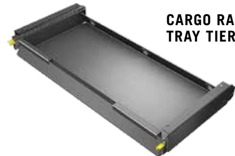
CARGO RADIO TRAY TIER