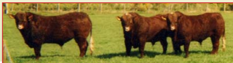
3 Homebred Bulls Typical example of Bulls bred at Whitebog