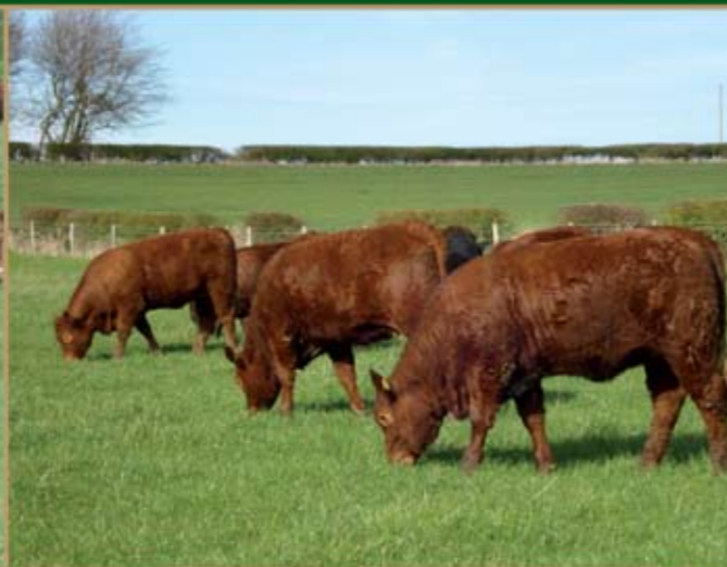
Superb Bulling Heifers