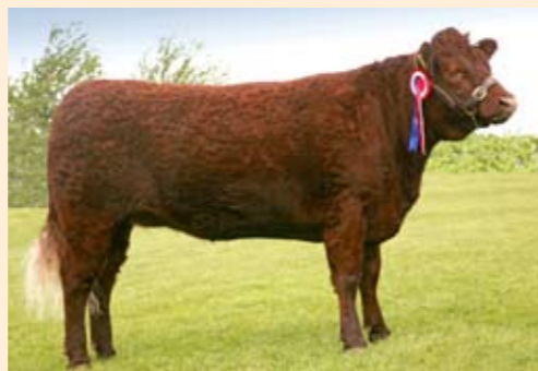
Manor Lane Diva, Salers Champion Female 2012