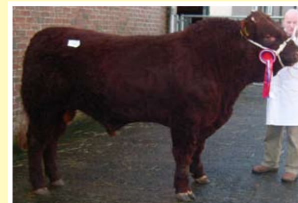
WHITEBOG GLENLIVET Supreme Champion Castle Douglas Premier Sale 2012

Reserve Show Champion – Cumbrian Vermille 520 Poll, Farmstock Genetics, Selkirk