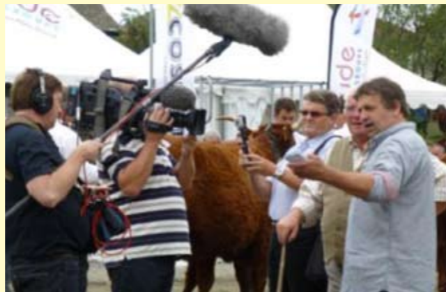
Filming in the crowd

We couldn't visit Salers without seeing this man