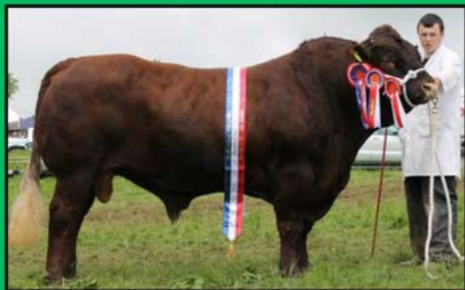
Lisnamaul Buster Champion at Saintfield 2012