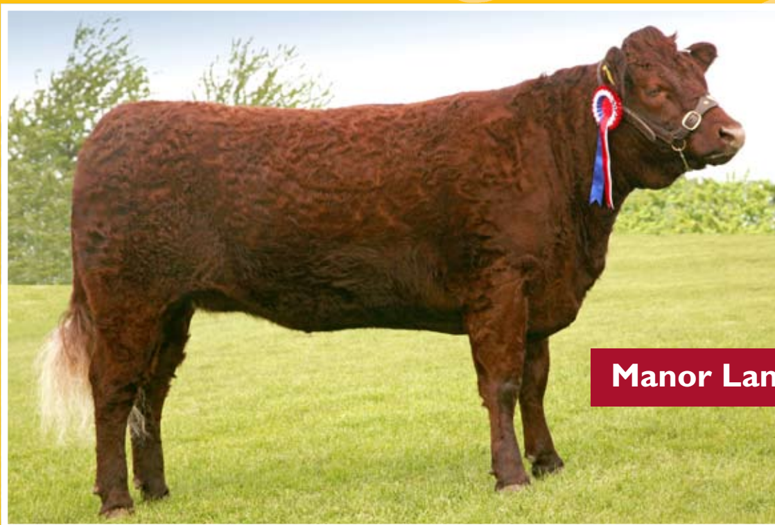
Manor Lane Diva