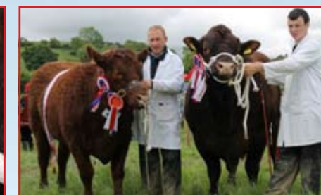
Reserve & Champion at Saintfield Show 2012

Class No. 213. Cow in calf or calf at foot