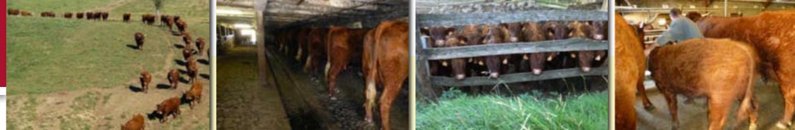
Coming in for milking

Early the next morning, we all flew out from Liverpool to Limoges airport and picked up a couple of hired cars to drive down to Salers. A good cameraman is always on the lookout for great shots; every so often, the crew would suddenly pull over because there was a great piece of sweeping road or a good backdrop of trees to film! We started to realise that what looks so seamless on a TV programme is actually put together very carefully with a lot of attention to detail.