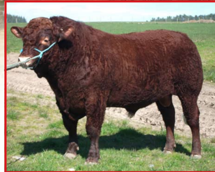
Top selling WHITEBOG FURY

The society, in association with the Wallets Marts, staged their first annual spring sale of Salers Cattle at Castle Douglas on Saturday 26th May 2012.