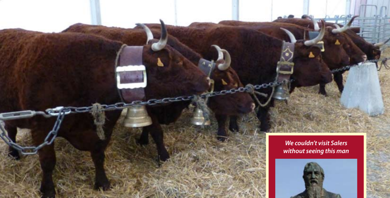
"Dressed in their best"