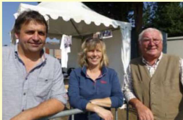
Enjoying the show