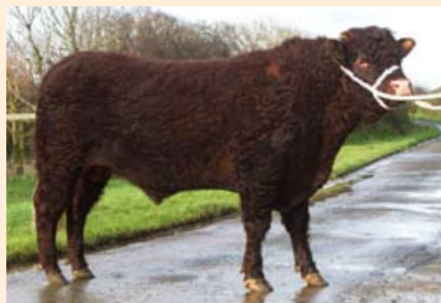
Cumbrian Red Hector, Salers Champion Male 2012