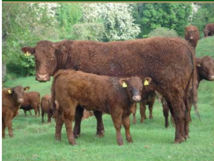
Lowick Hall Herd