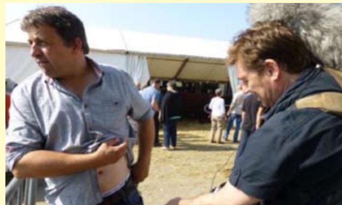
Being wired for sound