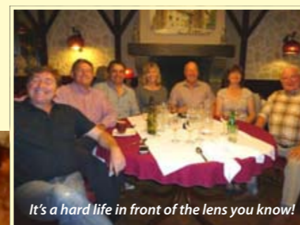
It's a hard life in front of the lens you know!

After milking is over, the calf is allowed to suckle again briefly