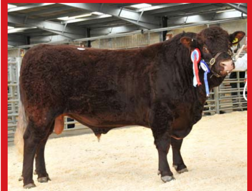
Reserve Show Champion - SEAWELL FAROH Sire Trafalgar – Dam Viennoise