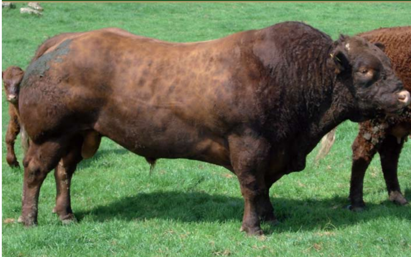
Ambassador , Champion Junior Bull of 15th Salers Society Show