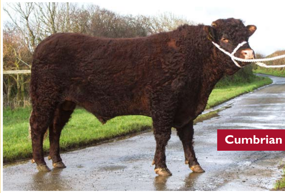
Cumbrian Red Hector