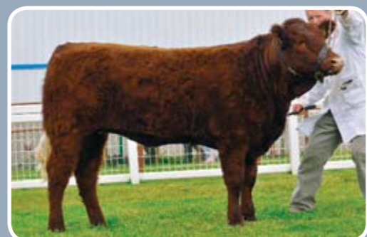
“Cleuchhead Mhairi 9th”

“Cleuchhead Mhairi 9th” 2010 RHASS Champion Female