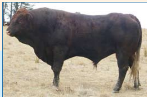
Merrindah Dover Bull