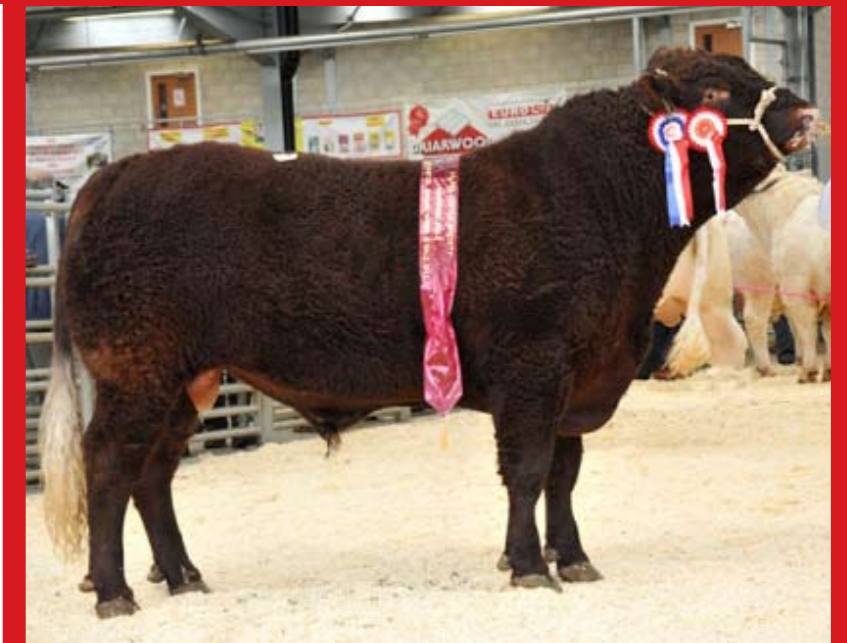
Show Champion - GLYNNE HALL DYNAMITE Sire Mock Arwyn – Dam Cuil Vixen

Rigel Pedigree, Levenfields, N. Yorkshire