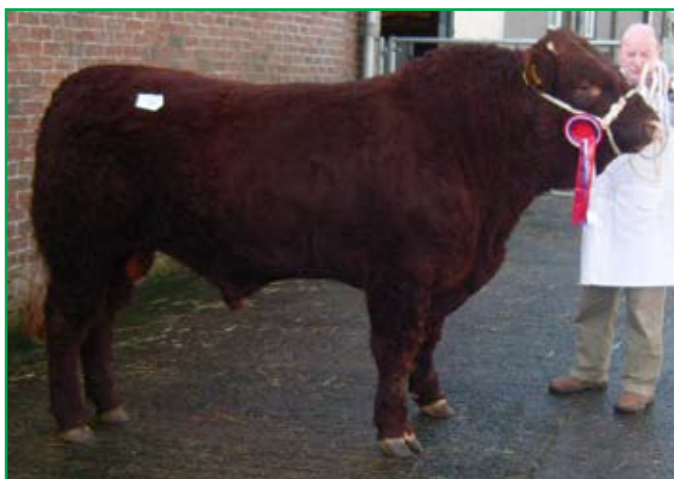
WHITEBOG GLENLIVET Supreme Champion Castle Douglas Premier Sale 2012