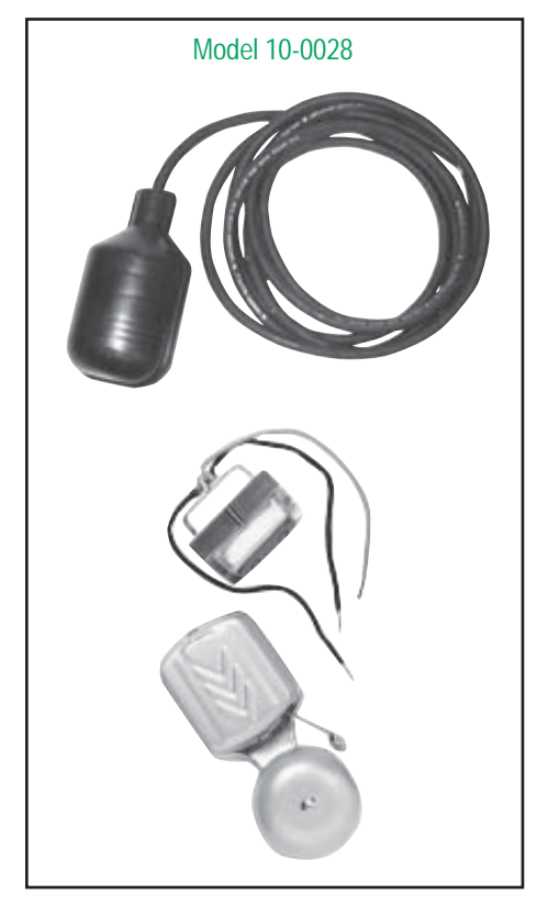
Note: All variable level float switches in this section are mechanically activated and do not contain mercury.