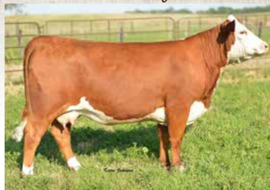
DAM OF LOT 13 H MS 5139 ADVANCE 4006 ET