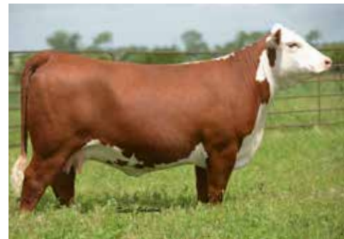
DAM OF LOT 134-135 - CRR 109 KELLY 303

Top 10% UREA, Top 10% YW, Top 15% $BII, Top 15% $BMI, Top 20% Stay, Top 20% WW