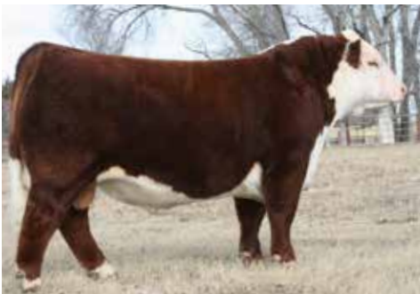
FULL BROTHER OF LOT 57 - H DEBERARD 7454 ET

Top 3% UFat, Top 15% $CHB, Top 15% CWT, Top 15% UREA, Top 20% $BMI