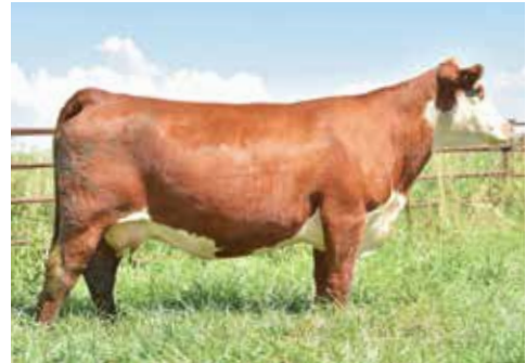
DAM OF LOT 198 - BR BELLE AIR 6011

UPS DOMINO 3027 CHURCHILL LADY 7202T ET CHURCHILL YANKEE ET CHURCHILL LADY 7210T L1 DOMINO 03571 HH MISS ADVANCE 1088L CL 1 DOMINO 2136M HH MS ADVANCE 8037H