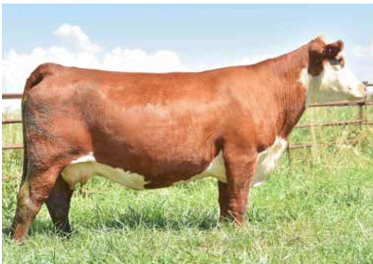
DAM OF LOT 11 - BRL ENVY 401A

Probably as high of a performing bull as we have. To go along with this he should also prove to be extremely maternal. Carload bull. Top 1% $CHB, Top 1% CWT, Top 1% M&G, Top 1% MW, Top 1% MWW, Top 1% Mtnl, Top 1% TM, Top 1% UREA, Top 1% WW, Top 2% YW, Top 15% Milk, Top 20% $BII, Top 20% UFat