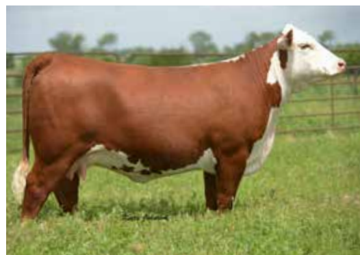
DAM OF LOT 14 CRR 109 KELLY 303