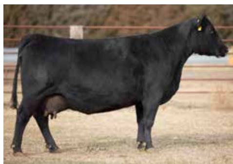
DAM OF LOT 250 - SITZ BLACKCAP 342U

Cowboy Up is simply the cowboys kind! His sons are highly functional, very sound, rugged and have extra muscle. We can not wait to have daughters in production. He comes from a highly maternal cow family. Thirty sons sell out of this SUPERIOR range bull maker!