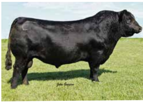
REFERENCE SIRE - CONNEALY SPUR