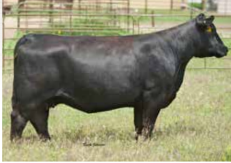
DAM OF LOT 252 - SITZ FOREVER LADY X6