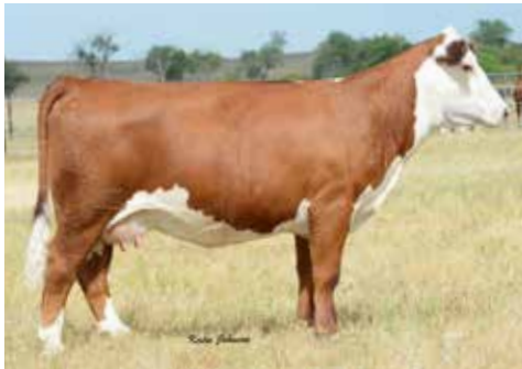
DAM OF LOTS 47-51 - KJ 804P MARGO 426T

Top 10% YW, Top 15% Stay, Top 20% $BII, Top 20% $BMI, Top 20% WW