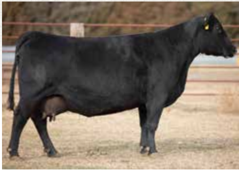
DAM OF LOT 295 - SITZ BLACKCAP 342U