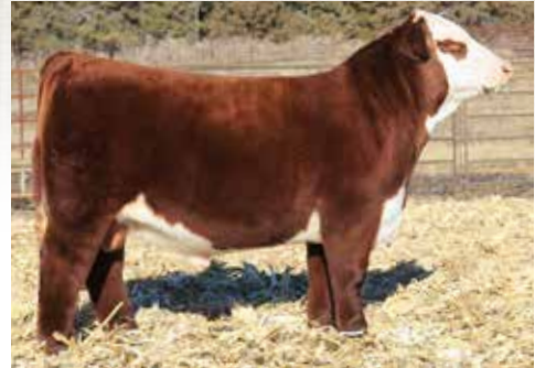
FULL BROTHER OF LOT 198 - H BELL RINGER 8459 ET

CL 1 DOMINO 9126J 1ET KCF MISS 3008 N344 GERBER SQUIRE 627S GERBER 116K HOLLY T115 SHF WONDER M326 W18 ET NJW P606 72N DAYDREAM 73S GOLDEN OAK OUTCROSS 18U HH MISS ADVANCE 316N 1ET