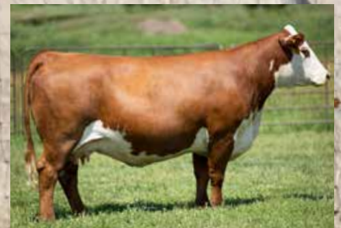
DAM OF LOT 154 - H MS 0103 MARIAH 4488 ET