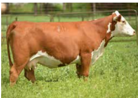
DAM OF LOT 25 - H AF ROSLYN 2091 ET