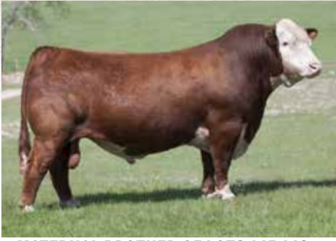
MATERNAL BROTHER OF LOTS 145-148 LCX PERFECTO 11B ET