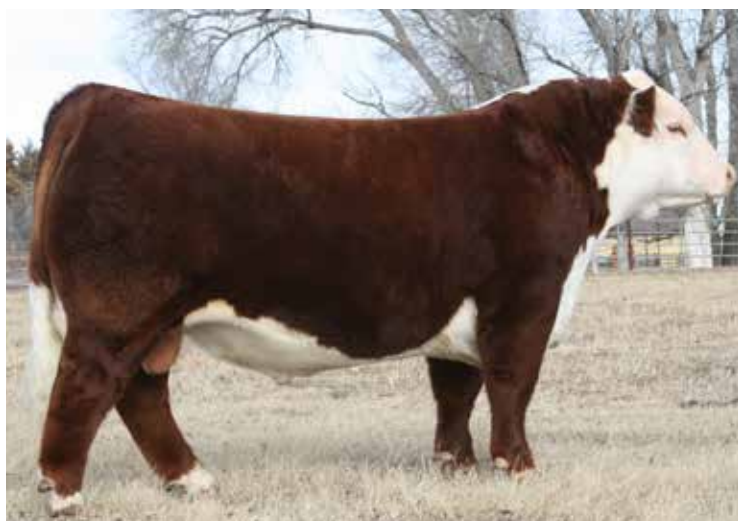
MATERNAL BROTHER OF LOTS 3-6 - H DEBERARD 7454 ET

Top 1% $CHB Top 1% UREA, Top 2% CWT, Top 3% YW, Top 5% M&G, Top 5% MW, Top 5% MWW, Top 5% Mtnl, Top 5% TM Top 5% WW, Top 15% Milk, Top 20% $BII Top 20% UFat