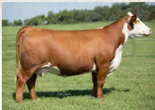
DAM OF LOT 15 RST GAT NST Y79D LADY 54B ET