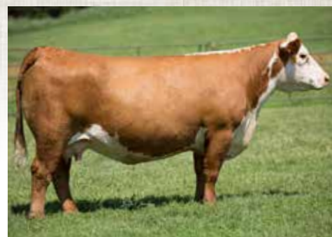
DAM OF LOT 128 - EXR TERRI 489

Top 2% SC, Top 2% WW, Top 3% YW, Top 10% $BII, Top 10% $CHB, Top 10% M&G, Top 10% MW, Top 10% MWW, Top 10% Mtnl, Top 10% TM, Top 15% $BMI, Top 15% CWT, Top 15% UIMF, Top 20% UREA