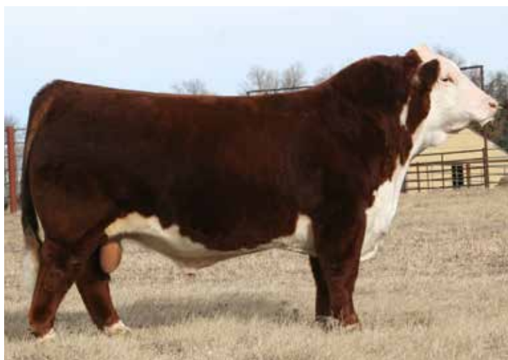
MATERNAL BROTHER OF LOTS 3-6 - H MONTGOMERY 7437 ET