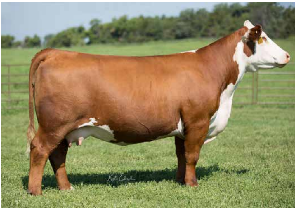
DAM OF LOTS 3-6, 15, 57, 126, 127, 152 RST GAT NST Y79D LADY 54B ET

A dark red, long outlined and heavy muscled power bull. This bull has lots of future. Both lots 3 and 4 are maternal brothers to Montgomery and DeBerard. Carload bull. Top 1% YW, Top 2% $CHB, Top 2% M&G, Top 2% MW, Top 2% MWW, Top 2% Mtnl, Top 2% TM Top 2% WW, Top 3% CWT, Top 15% Milk Top 15% UREA