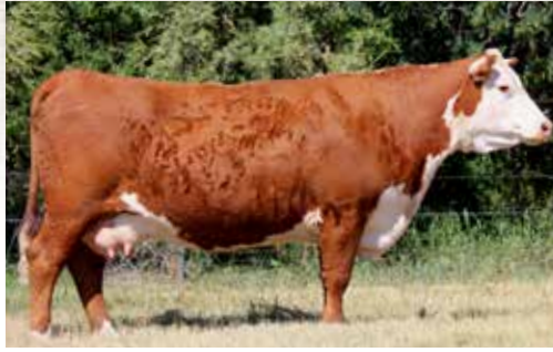
DAM OF LOTS 180-184 GRAND DAM OF LOTS 175-176 HH MISS ADVANCE 8255U