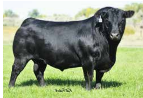
REFERENCE SIRE - LD CAPITALIST 316