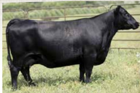
DAM OF LOTS 286-288 - S A V PRISCILLA 7374

Top 2% WW, Top 2% YW, Top 3% $F, Top 5% Fat, Top 15% $YG, Top 15% CWT, Top 15% REA, Top 20% RADG