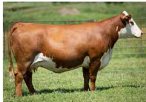
DAM OF LOTS 194-195 - H MS 0103 MARIAH 4488 ET

Top 3% UFat, Top 10% Milk, Top 15% M&G, Top 15% MW, Top 15% MWW, Top 15% Mtnl, Top 15% TM, Top 20% Stay, Top 20% YW