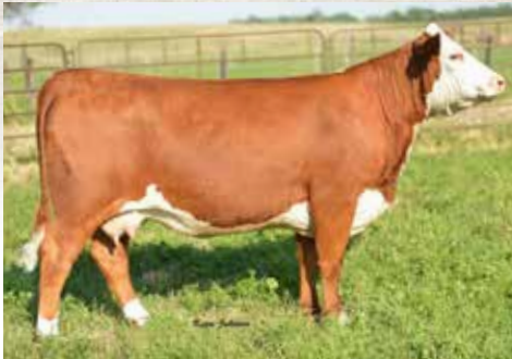
DAM OF LOTS 16-21 - H MS ADVANCE 4006 ET