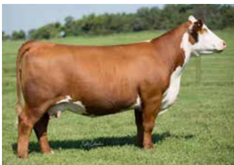
DAM OF LOT 126-127 - RST GAT NST Y79D LADY 54B ET