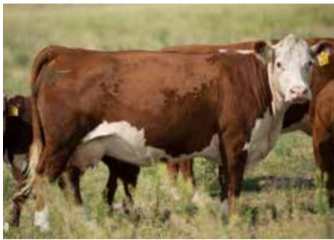
DAM OF LOT 132 - H WR MS 1231 REDEEM 4076 ET