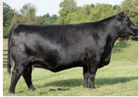
DAM OF LOT 253 - FLAG DONNA 10678