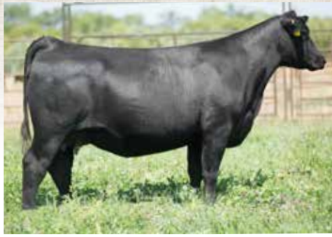
DAM OF LOTS 308-309 - HOFFMAN BARBARAMERE 5026