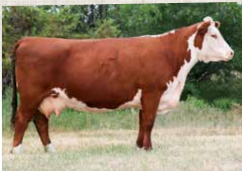
DAM OF LOTS 52-54 - KJ 804P MARGO 426T