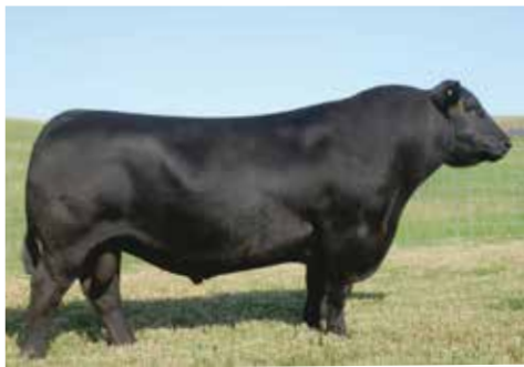
REFERENCE SIRE - S A V SENSATION 5615

Top 2% CWT, Top 3% $W, Top 5% Doc, Top 10% $B, Top 10% $F, Top 10% REA, Top 10% WW, Top 10% YW, Top 15% Milk, Top 20% SC