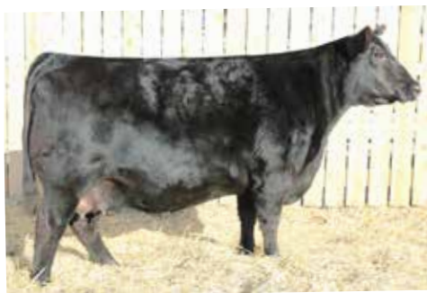
DAM OF LOT 284 & 285 - FLAG QUEEN W 00649