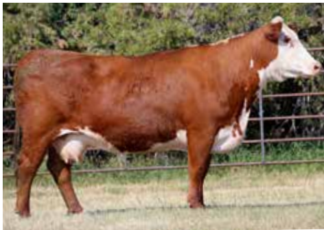
DAM OF LOTS 35-38 - HH MISS ADVANCE 9228W

He's the DADDY OF THEM ALL! He has nothing left to prove. Sons have sold to some of the best purebred and commercial producers around. Daughters have excellent udders with good milk flow.