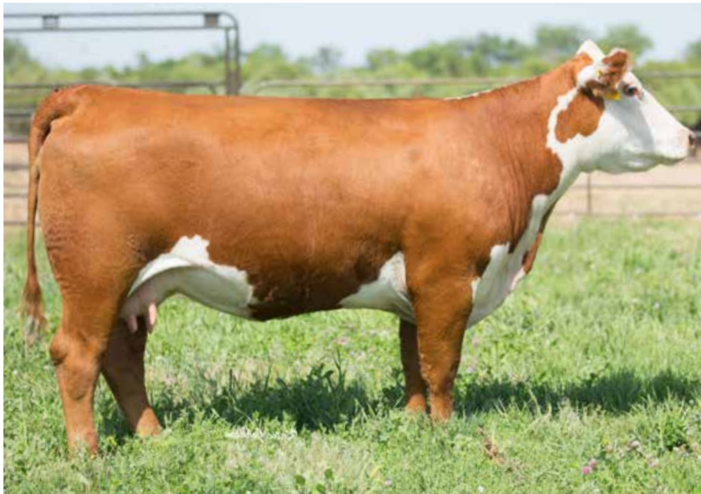
DAM OF LOT 10 - CHURCHILL LADY 527C

This is a moderate framed bull with a huge rib cage and tons of muscle over his top and back through his hip. He has a tremendous amount of testicular development and looks like a range bull making machine. Carload bull. Top 2% M&G, Top 2% MW, Top 2% MWW, Top 2% Mtnl Top 2% TM, Top 3% Stay, Top 5% Milk, Top 10% $BMI, Top 10% UREA, Top 10% WW, Top 15% $BII, Top 20% UFat Top 20% YW