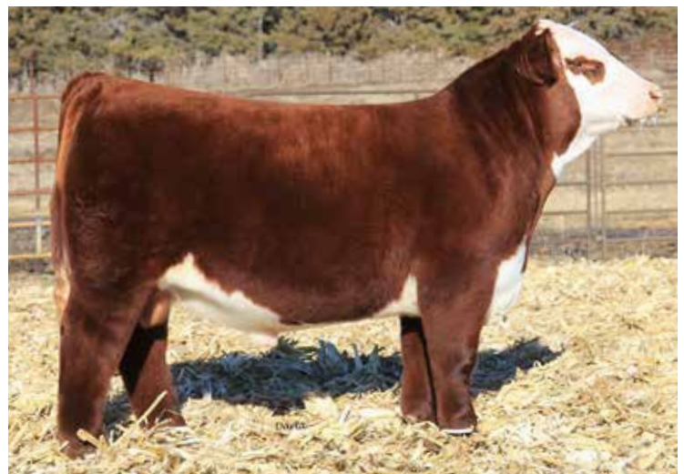
FULL BROTHER OF LOTS 11 - H BELL RINGER 8459 ET