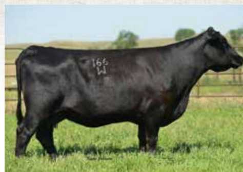
GRAND DAM OF LOTS 302-303 - SITZ EMMA E 166W

Top 3% MCW, Top 10% CED, Top 20% CEM, Top 20% MCE, Top 20% WW