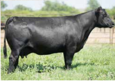
DAM OF LOTS 289-291 - SITZ HENRIETTA PRIDE 617T