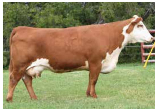
GRAND DAM OF LOT 13 HH MISS ADVANCE 5139R ET