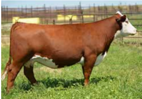
DAM OF LOTS 190-193 - H MS824 EXCEL 4146 ET

Top 4% TEAT, Top 5% M&G, Top 5% MW, Top 5% MWW, Top 5% Mtnl, Top 5% TM, Top 5% UDDER, Top 10% Milk, Top 10% SC, Top 10% UREA, Top 10% WW, Top 15% CEM, Top 15% MCE, Top 20% $BII, Top 20% CWT, Top 20% YW