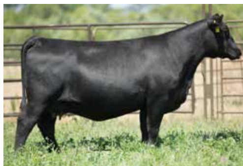
DAM OF LOTS 304-307 - HOFFMAN JKN MS ANGUS 5016