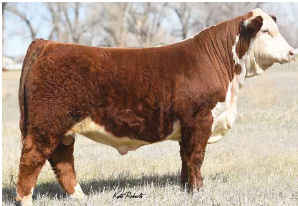
FULL BROTHER OF LOTS 7-8 - H FHF PROPEL 6830 ET Sold in 2017 to Topp Herefords and Genex

BORDERLINE HEIFER BULL. This bull is a definite sale feature. He is very square built and has a lot of depth through his body and flank. We think he is very unique as he is a bull we would like to AI heifers to in the future. It would help a lot of breeders in terms of fleshing ability and phenotype. Carload bull. Top 10% $BII, Top 10% $BMI, Top 10% BW, Top 10% M&G, Top 10% MW, Top 10% MWW, Top 10% Mtnl, Top 10% Stay, Top 10% TM, Top 10% WW Top 10% YW, Top 15% UREA, Top 20% CWT Top 20% Milk