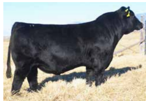
REFERENCE SIRE - THSF LOVER BOY B33

HEIFER BULL Top 2% CED Top 3% Marb Top 4% BW Top 15% CEM Top 15% MCE