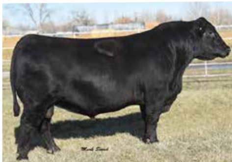
REFERENCE SIRE - CONNEALY CONFIDENCE PLUS

HEIFER BULL Top 5% CEM, Top 5% MCE, Top 10% $QG, Top 10% $W, Top 10% Marb, Top 10% Milk, Top 15% $G