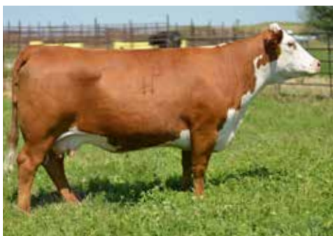
DAM OF LOTS 26-31 - HH MISS ADVANCE 1181Y ET

HEIFER BULL. Top 1% UREA, Top 2% CWT, Top 3% $CHB, Top 4% UIMF, Top 5% $BII, Top 5% CED, Top 10% $BMI, Top 10% BW, Top 10% CEM, Top 10% MCE, Top 15% M&G, Top 15% MW, Top 15% MWW, Top 15% Mtnl, Top 15% TM, Top 20% Stay, Top 20% WW