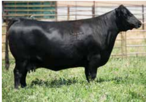
DAM OF LOTS 318-319 - GO MS GOLD RUSH 15Z

This herd sire is finally catching the attention he deserves! Many of the nations top bull producers have inquired about using him this fall. This is the smallest offering of sons we will have for years to come. HE DOES IT ALL! Maternal brother sells as lot 294.