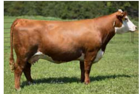
DAM OF LOT 188 - H MS 5139 ADVANCE 4207 ET

Straight Horned Top 5% UFat, Top 20% CEM, Top 20% MCE, Top 20% Milk, Top 20% SC, Top 20% Stay