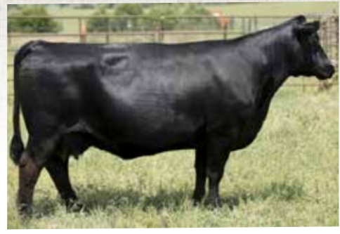
DAM OF LOTS 292-293 - B/R BLACKCAP EMPRESS 770

Top 3% $W, Top 5% WW, Top 10% CWT, Top 15% $F, Top 15% YW, Top 20% $B, Top 20% Fat