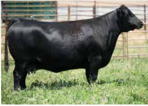
GRAND DAM OF LOTS 336 & 337 - SITZ HENRIETTA PRIDE Y2