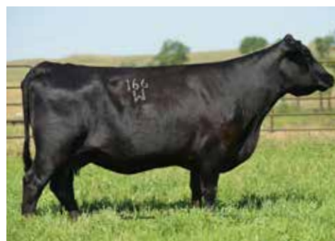
DAM OF LOT 251 - SITZ EMMA E 166W