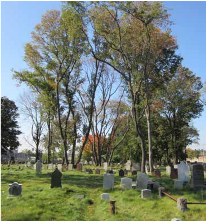
New grass and plantings at Prospect Cemetery, Queens