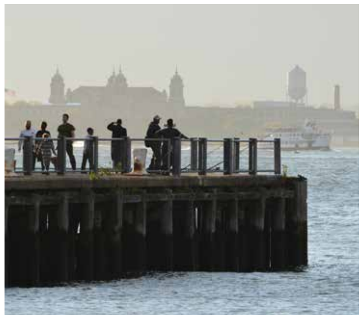
Pier 5 Brooklyn Bridge Park facing New York Harbor and Ellis Island

One of the debates during the conference was the temptation of cash-strapped agencies to use climate change projections to justify not spending new funds on restoring or stabilizing certain at risk structures and sites. These discussions are in their preliminary stages. Conservationists and preservationists are just beginning to analyze and formulate realistic approaches to these challenges.