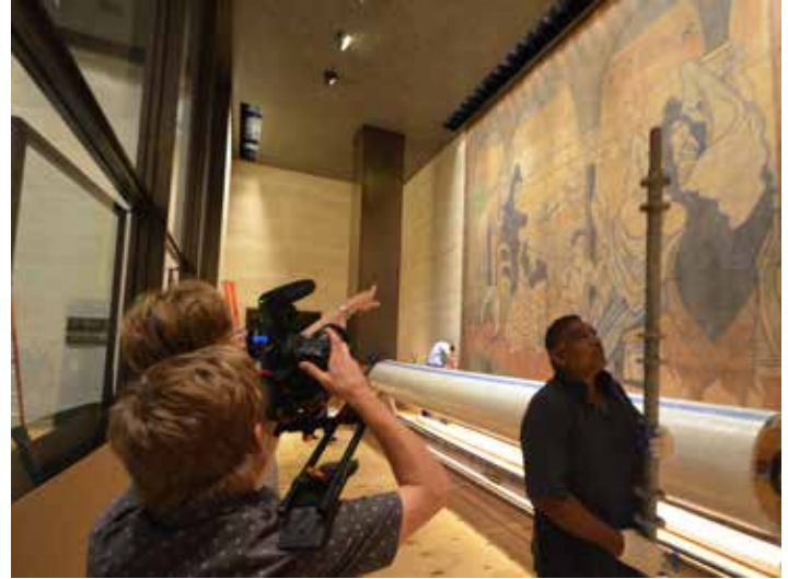
The New York Times documented the removal of the Picasso Curtain.

On December 15th, the Conservancy transferred ownership of the Curtain to the Historical Society. The Society will pay the storage fee to keep the Curtain at the Conservation Center until it is ready to re-hang it in its galleries in the spring of 2015.