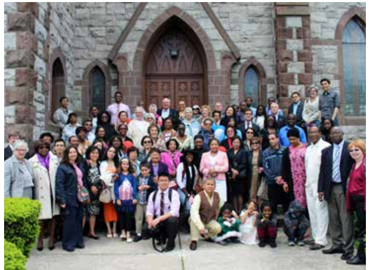
Sacred Sites Open House Weekend - First Presbyterian Church of Newton (Queens)