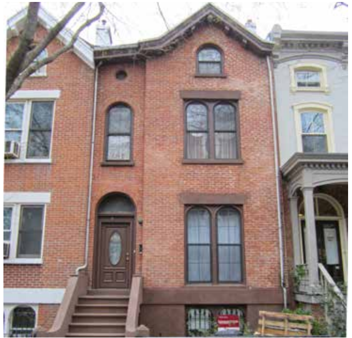
125 Vanderbilt Avenue, Wallabout Historic District, Brooklyn

The building itself is an Italianate row house built in 1853 along with its twin at 123 Vanderbilt Avenue; it contains the owner's triplex and a rental apartment on the ground floor. With a project cost of under $50,000, Cecil King Stone & Restoration performed an assortment of work, including the restoration of the stoop, fence, gate, and cornice; the removal of aluminum panning on window surrounds; and the repair of the bluestone sidewalk. The project architect was gormanschweyer .