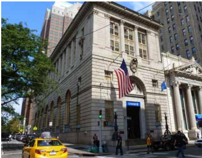
177 Montague Street, Brooklyn

The watchtower was built in 1855 and stands on a rocky outcropping in what was originally known as Mount Morris Park, now known as Marcus Garvey Park. It is a four-tiered cast iron structure with a central spiral staircase and octagonal lookout. A large bell used for alerting the various local fire companies hangs halfway up the structure. It is the only surviving fire tower in New York City. Use was discontinued in 1878, after the installation of fire alarm boxes, though the bell kept being rung for many years on Sunday noon at the request of the neighborhood.