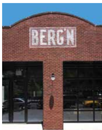
Berg'n, 899 Bergen St, Brooklyn