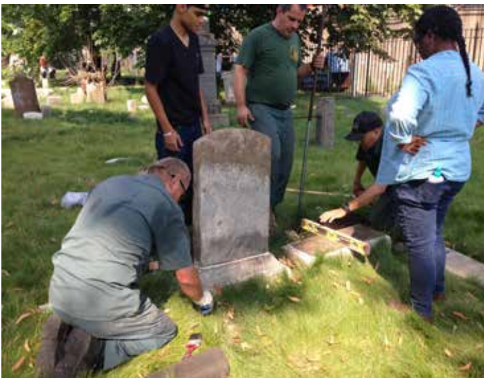
Brooklyn's historic Green-Wood Cemetery donated its facilities staff to re-set 50 toppled markers in the front section of landmark Prospect Cemetery in Queens.