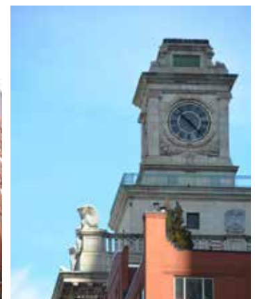
Clock tower - 346 Broadway, Manhattan