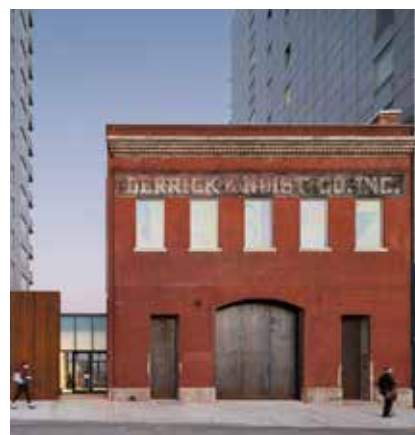
SculptureCenter, Long Island City

A new addition and connecting courtyard both enlarge and enhance the Long Island City home of SculptureCenter . The original 1908 building, once a trolley repair shop, had been lightly renovated when the Center moved in, in 2001. This project increased space by 50%, allowing for many missing functions, such as a reception area and bookshop, as well as additional gallery space. New Cor-Ten steel doors on the original gallery match the exterior of the addition and reinforce the building's industrial heritage.