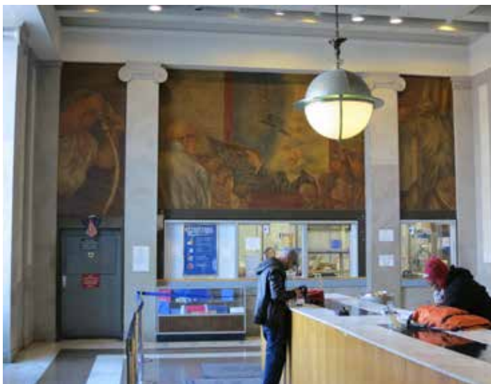
Bronx General Post Office, 560 Grand Concourse, Bronx

The Conservancy holds a preservation covenant on the Bronx General Post Office. It specifically covers the works of art in the post office's public rooms. The covenant was officially conveyed on August 15, 2014 when the building was sold to a new owner, Young Woo and Associates of Manhattan. That company owns the landmark AIG building in lower Manhattan and has developed commercial properties such as the Super Pier on Eleventh Avenue near W.15th Street. The new owner plans to turn the vast mail sorting area that takes up most of the 175,000 square foot building into a commercial marketplace similar to Chelsea Market.