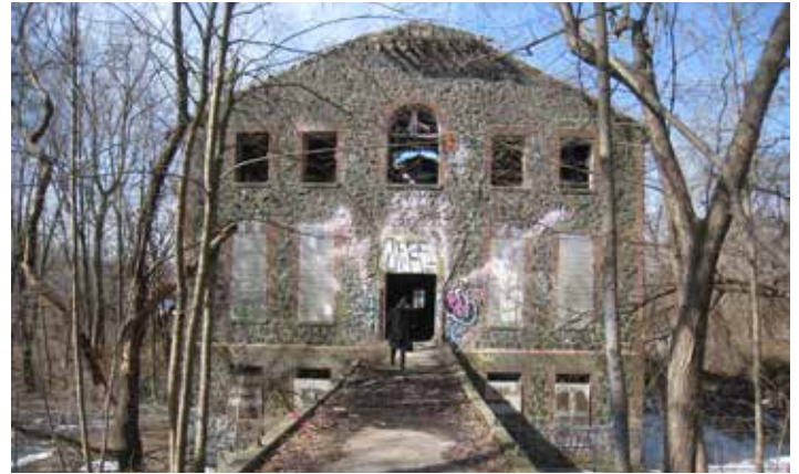
New York City Farm Colony - 475 Brielle Avenue, Staten Island

We supported a proposal to rehabilitate and reuse buildings at the New York City Farm Colony (475 Brielle Avenue, Staten Island, New York City Farm Colony-Seaview Hospital Historic District), applauding the vision of the developer and consultants in undertaking the challenge this property presents. Decades of deterioration have left many of the Farm Colony buildings beyond repair and created a situation that has frustrated the preservation community, leaving little choice but to demolish several of the structures. The proposal responds to the remaining site in a respectful way, analyzing years of land use plans, stabilizing and adapting some buildings, and salvaging historic fabric from others. The new construction reflects historic styles, and all components are connected within the historic landscape. The Commission approved the proposal.