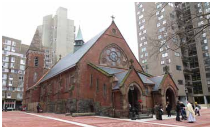
Chapel of the Good Shepherd, Roosevelt Island

Developers who plan to adapt it to hotel use have purchased the handsome four-story foundry. It is situated in a newly desirable section of Williamsburg, and the proposed designs of the new hotel are innovative. The Conservancy is consulting with the architects who are designing an adaptive reuse for the building.