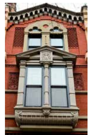
Kerwin Residence, Upper West Side

After the well-known Tavern on the Green restaurant closed, the City decided to re-invent the venue, removing decades of inappropriate additions, and restoring the picturesque building. The Victorian Gothic pavilions were designed by Jacob Wrey Mould in 1871 to serve as a sheepfold and caretaker's cottage. Conversion to restaurant use and over 20,000 square feet in additions radically altered the space. This renovation reduced the size in half, peeling away ungainly additions to reveal beautiful red brick façades, restoring damaged polychrome slate roofs, and replacing oversized window openings with more historically appropriate fenestration. The Tavern is once again the jewel of Central Park.