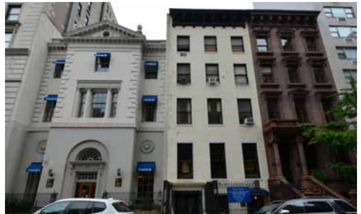
39 East 72nd Street (middle building), next to 41 East 72nd Street on right, Manhattan

Last year, the Conservancy gave a Lucy G. Moses Preservation Award to 41 East 72nd Street for the meticulous restoration of its neo-Grec façade, as well as its fine interior rehabilitation. The building was once one of a group of seven; only two are extant. We spoke against a proposal for façade renovation at 39 East 72nd Street , which would ignore the 1882 neo-Grec precedent in favor of a faux, early 20th century Beaux-Arts styling, with a mansard roof that has no historic connection to the original or proposed style, and a visible penthouse that would bring the height well above its neighbors. The Commission approved the proposal.