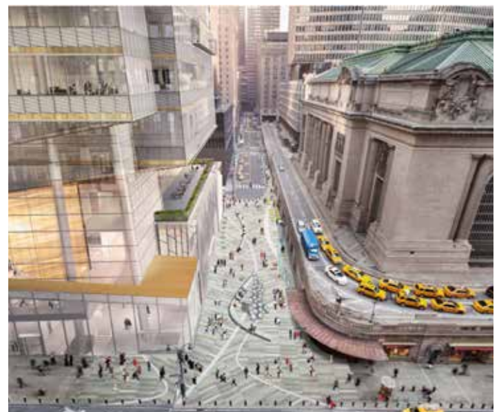
A rendering of One Vanderbilt Tower (left), by Kohn Pedersen Fox Associates Grand Central Terminal is on the right