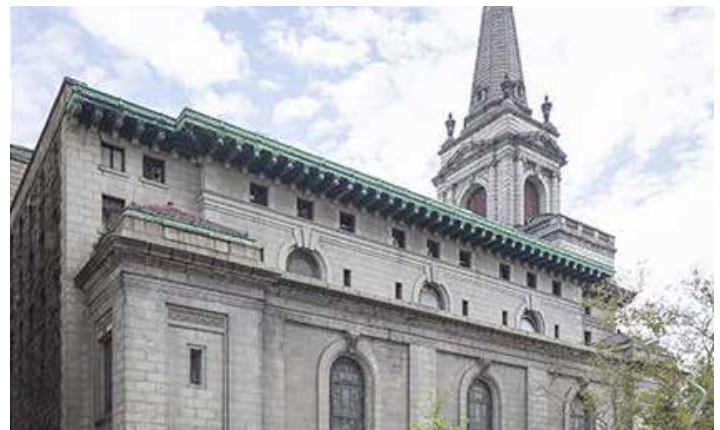
Former First Church of Christ, Scientist, 361 Central Park West, Manhattan

A proposal to adapt the former First Church of Christ, Scientist (361 Central Park West) for residential use elicited a mixed response. In total, we found that it would be a sensitive adaptation that strives to maintain this landmark, while enabling a new and sustaining use, but we recognized that the solid and austere beauty of the exterior would have to be compromised to meet requirements for the new use, and that the elegant, but undesignated, interior has been demolished. We supported the most visible changes, including the insertion of many window openings and found that the proposed rooftop addition would be modest and respectful of the building's massing and proportions. We also suggested that elements of the interior will be salvaged and reused to remind those using the building in the future of its past. The Commission approved the proposal with a reduction in the number of new windows.