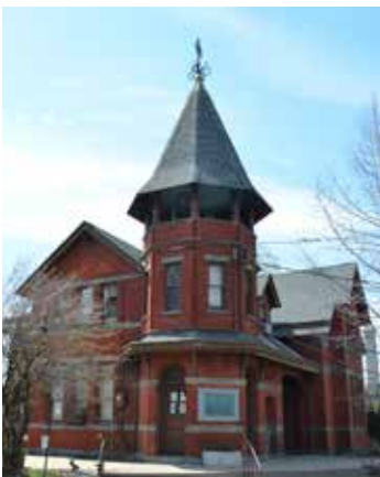
Calvary Cemetery Gatehouse, Queens

Circa 1880, on the grounds of the proposed Snug Harbor Historic District on Staten Island.