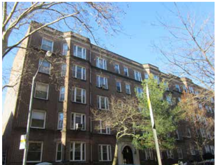
35-56 79th Street, Jackson Heights Historic District, Queens

35-56 79th Street is one building in the Hampton Court complex; it contains 15 units and an apartment for a superintendent. With a $375,000 loan and other funding from the Coop, the restoration work included the full replacement of the roof and skylights, the repair and replacement of the terra cotta and brick parapet, and other essential masonry work throughout the building. Artisan Restoration Group was the contractor, and Easton Architects, the project architect.