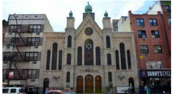
Tifereth Israel, the Town and Village Synagogue - 334 East 14th Street, Manhattan

The Park Avenue Historic District runs from 79th to 97th Street, where Park Avenue is lined with stately early 20th-century, high-rise apartment buildings which create a dignified sense of place. They were designed by the prominent architects of the day, including George & Edward Blum, Rosario Candela, J.E.R. Carpenter, Emery Roth, and Schwartz & Gross in styles typical of the era, such as Renaissance Revival and Georgian Revival. Many have retained their original height and scale, with decorative elements intact. One point of contention was the parish house annex of the Park Avenue Christian Church (1010 Park Avenue). While the designation of the Bertram Goodhue-designed church building was never in doubt, only a fragment of the annex's historic fabric remained when a new building replaced it in the 1960s. The Conservancy's testimony suggested that the LPC would have to take a nuanced approach to the designation; they did vote to call it "no-style," opening the way to development. The District was designated in April 2014.