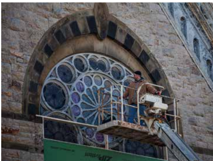
Window restoration at First Presbyterian Church, Hudson