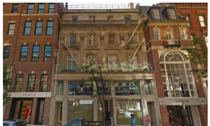
817-819 Madison Avenue, Manhattan

The Conservancy opposed a planned rear addition to 817-819 Madison Avenue , which would irreparably harm an open space created when noted architects Carrère and Hastings designed two Beaux-Arts houses with connecting rear yards for two branches of the same family. Over the years, there have been alterations to the rear façades, but the historic relationship between the two buildings, characterized by the open space that remains, and should not be diminished by a rear yard addition that extends fully to the lot line. The Commission approved the proposal.