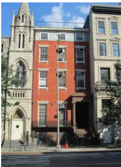
Isaac T. Hopper Home, 110 Second Avenue, Manhattan

On September 11, 2001, her crew volunteered Harvey to supplement the two active City fireboats when the World Trade Center was attacked. For four days, those three boats (including the 1938 National Historic Landmark Fire-fighter) provided the only water available for firefighting at the World Trade Center site.