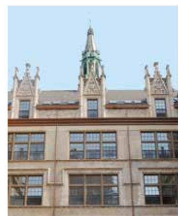
El Barrio's Artspace PS 109, East 99th Street, Manhattan