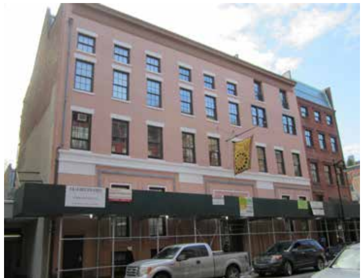
New York Studio School, 8 to 14 West 8th Street, Manhattan