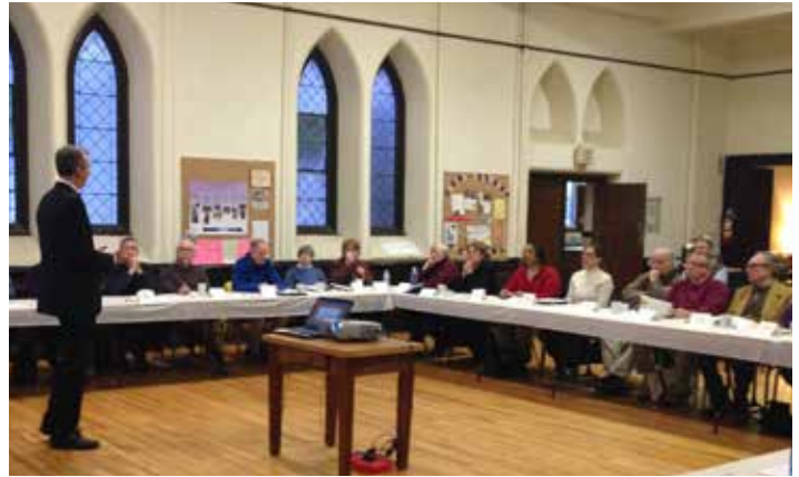
Asset Management Roundtable at Emmanuel Baptist Church in Albany

Participants thanked the Conservancy both for the program content, and for the support that comes from knowing that there are many other institutions all addressing the same challenges.