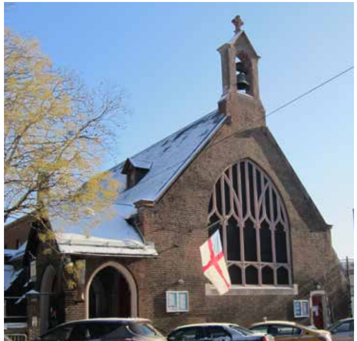
St. Mary's Episcopal Church, 521 West 126th Street, Manhattanville, Manhattan

The façades that were remodeled in 1931 had deteriorated severely over the years. In 2009, the New York State Environmental Protection Fund awarded a matching grant of $250,000 to the School toward the estimated $530,000 cost of restoring the front façades of the four buildings. This work included the restoration of the stucco on three of the façades; the cleaning and re-pointing of the fourth brick building; the restoration of the frieze and cornice; the restoration or replacement of various windows; and various other items. A Historic Properties Fund loan of $250,000 and grant of $10,000 served as the match to the State grant, which was administered by Fund staff. Kaitsen Woo and Jonathan Raible served as the architects, with Titan Restoration as the general contractor.