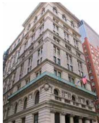
346 Broadway, (clock tower not shown)