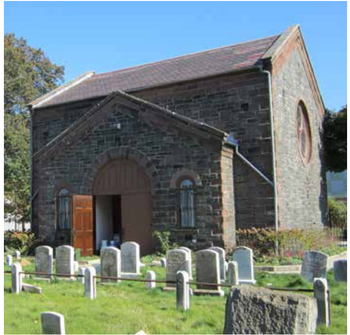
Prospect Cemetery and the Chapel of the Sisters

One of the highlights of 2014 was the pro bono help of Green-Wood Cemetery. For three days, Green-Wood donated its facilities staff to re-set 50 toppled markers in the front section of the cemetery. The visual difference is extraordinary. Many thanks to Green-Wood Cemetery for its assistance and support.