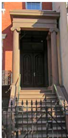
Hopper Home portico restoration