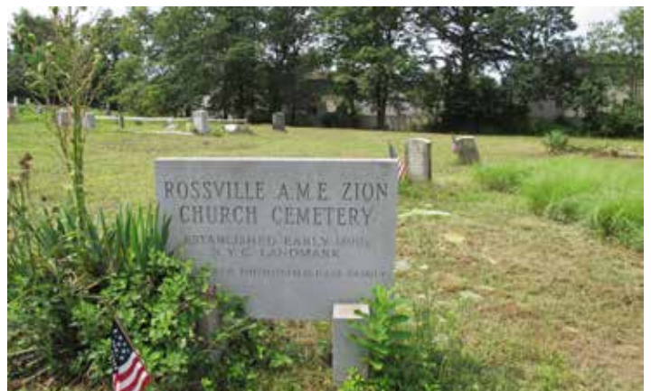
Rossville A.M.E. Zion Church Cemetery, Rossville, Staten Island