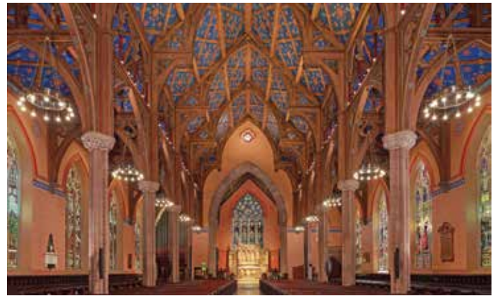
Grace Episcopal Church, Brooklyn Heights

Both the interior and exterior of Grace Episcopal Church (Brooklyn Heights), a mid-19th century Richard Upjohn church, have been restored, to stunning effect. The removal of layers of brown overpaint on the wood-and-plaster interior revealed a dazzling polychrome paint scheme, with a magnificent blue-and-gold starburst pattern at the ceiling. Previously, it had only been seen in black and white photographs. A new copper roof and repairs to the brownstone will protect the sanctuary. The project also improved electrical, plumbing, lighting, HVAC, and heating systems at this landmark church.