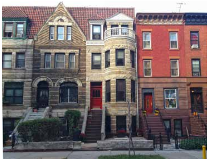
1199 Bergen Street (middle with rounded bay), Crown Heights North Historic District, Brooklyn