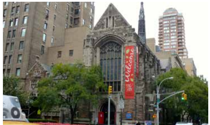
Park Avenue Christian Church's annex, 85th Street and Park Avenue, Manhattan

We supported a proposal to demolish a building ( 8-10 West 17th Street ) within the Ladies' Mile Historic District and replace it with a residential tower, finding the demolition of the existing 1963 acceptable as it does not reflect "the changing nature of retailing, commerce, and manufacturing, as well as the advances in building technology, during the second half of the 19th century and in the first two decades of the 20th century," as highlighted in the Ladies' Mile designation report. We requested that the permit be clear that the decision is limited to only this building and its relationship to this district, and does not create a precedent. The Commission approved the proposal.