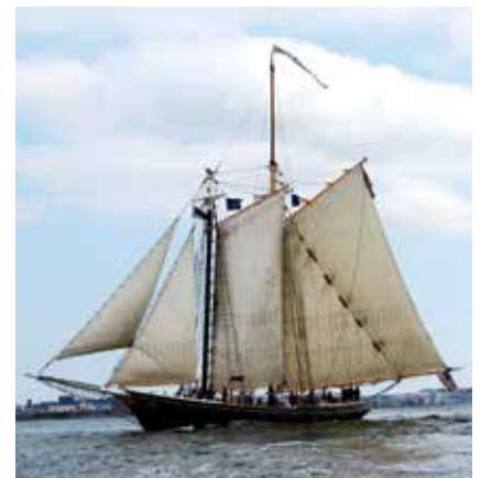
Schooner Lettie G. Howard, New York Harbor

Volunteers from the South Street Seaport Museum and students from the Harbor School, a maritime-themed public high school, came together to restore the Schooner Lettie G. Howard , one of the last still-sailing Fredonia-style fishing schooners in the country. They brought the 1893 ship to Maine for structural and hull repairs, and then completed restoration of the deck while the Lettie was docked in New York Harbor. Now she is certified for sailing and for service as a Sailing School Vessel, where every student aboard is a crewmember.