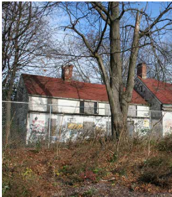
Manee-Seguine Homestead, 509 Seguine Avenue, Staten Island

Amster Yard is an individually designated ensemble of early and mid-nineteenth century residential buildings. The rear and front buildings surround an attractive interior landscaped garden that forms a miniature campus for the Institute, which is a cultural and educational nonprofit financed by the Spanish government. One of the Conservancy's earliest preservation easements covers this grouping. When the Institute was renovating the complex ten years ago, the Conservancy was very involved in the oversight of the restoration of the small buildings and garden. Recently, the Conservancy has been asked by the current director to assist and consult on some renovations and improvements they wish to make. These involve the relocation of the main entrance on East 49th Street and minor adjustments to the garden. Technical Services is advising them on what is acceptable under the terms of the easement.