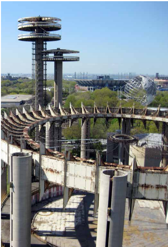
NY State Pavilion from the 1964/65 World's Fair, Flushing Meadows Corona Park, Queens

Philip Johnson designed the New York State Pavilion for the fair and it was to be the largest and most prominent of the fair buildings. It consists of three parts; the tower is the most visible and has three separate observation platforms. The "tent of tomorrow" is the most massive and is basically an outdoor arena that was originally roofed by cable-supported plastic panels. The third part is a circular building housing a theater; this building has been fully restored and is now the Queens Theater.