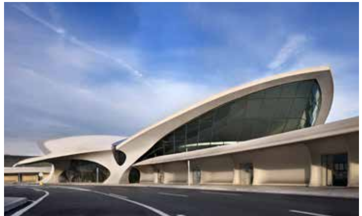
Former TWA Terminal, JFK International Airport, Queens

The hotel re-development of the former TWA terminal in JFK airport is temporarily on hold. The second developer that responded to the initial RFP backed out of the process, leaving the Port Authority no choice but to begin the process over again. A new request for proposal was issued in September, and a new developer was chosen. As a result, the Redevelopment Advisory Committee (RAC) will start meeting again in 2015 to review the most recent proposal.