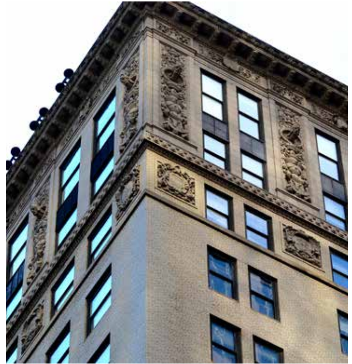
51 East 42nd Street - Warren & Wetmore, 1913 This building will be demolished to make way for One Vanderbilt (below)

The Steering Committee is expected to meet through the first half of 2015, and issue a report that will guide the Department of City Planning in creating a new rezoning proposal.