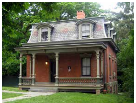
Second Empire Cottage, Snug Harbor Historic District, Staten Island