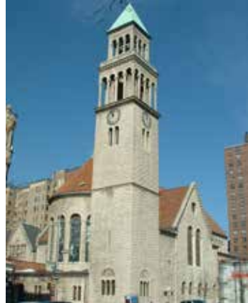
St. Michael's Episcopal Church, Manhattan