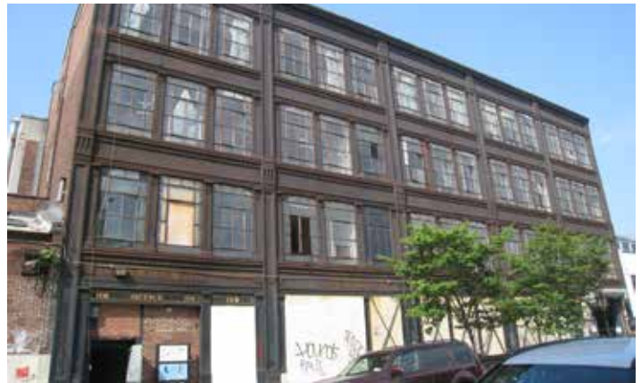
100-118 North 11th Street, Williamsburg, Brooklyn

Due to age and the environment, the sections of the pavilions are coming apart at the seams and there is biological growth apparent in certain areas. The Parks Department wishes to embark on a thorough restoration, but before funds can be committed for the work, a professional structures and materials assessment needs to be done to understand these unusual buildings. The Conservancy commissioned a technical conditions and materials report from engineering and conservation specialists. This type of report is one that the Parks Department finds extremely difficult to fund. The final report was received in January and was sent to the NYC Department of Parks and Recreation. They will use the report to help raise capital funds to execute the work.