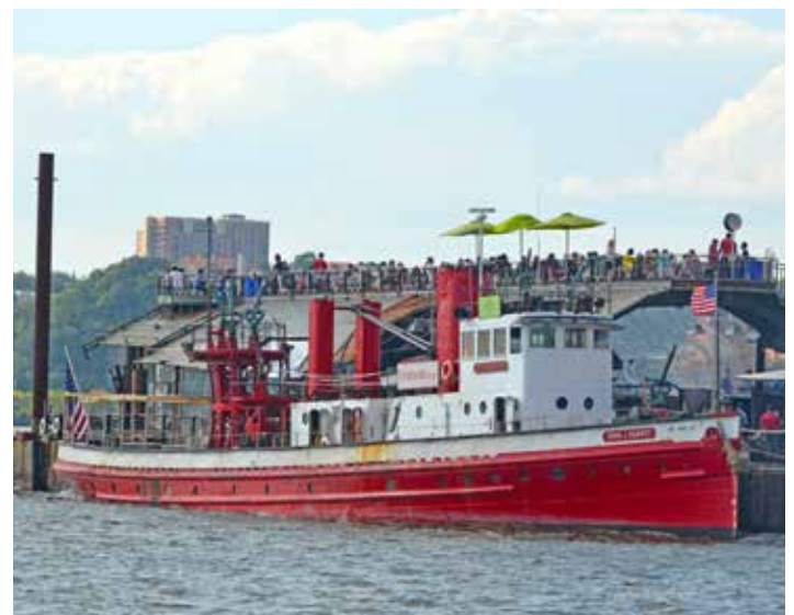
Fireboat John J. Harvey, Pier 66, North River (lower Hudson), Manhattan