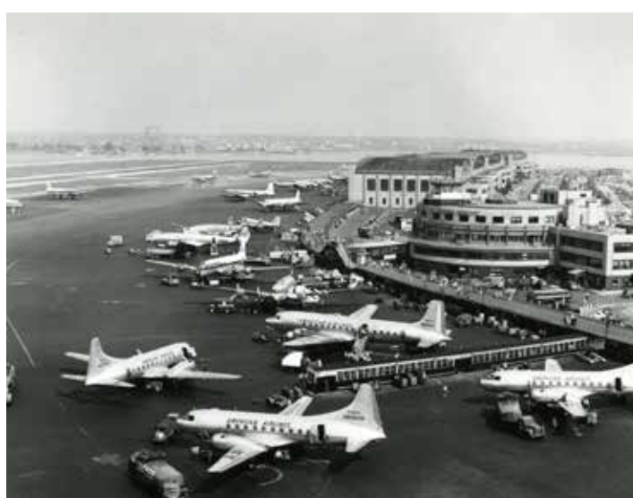
LaGuardia Airport, Queens, circa late 1940s