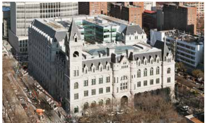
Conrad B. Duberstein U.S. Bankruptcy Courthouse, Brooklyn