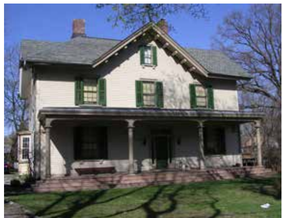
Curtis House, 234 Bard Road, Staten Island