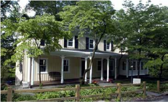
6 Ploughman's Bush Building, North Bronx (West 246th Street and Ploughmans Bush)

The buildings cited below represent a small sample out of nearly 100 pending landmarks that could be lost if the Commission decides to remove or "de-calendar" them.