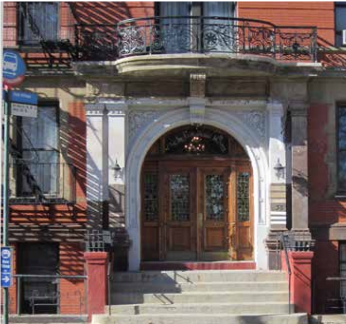
35 Mount Morris Park West, Manhattan

The Roosevelt Island Historical Society has completed the installation on Roosevelt Island of an ornate lamppost base that was once stationed at the Manhattan entrance to the Ed Koch Queensboro Bridge. There were two lampposts at the entryway; one remains, and one was taken down in 1974 to make way for the tramway. A City Ventures Fund grant of $10,000 helped to underwrite the cost of the project.