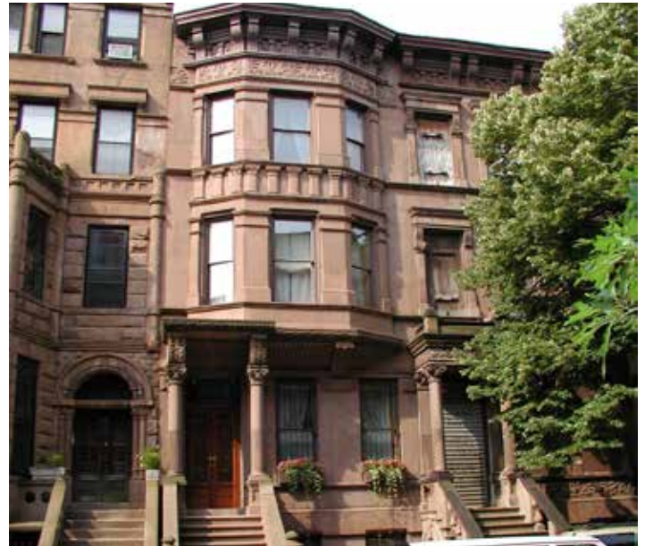
Brownstone restoration - 14 West 121st Street, Manhattan

Project management assistance is provided throughout the loan process. With outside professionals, Fund staff help borrowers to define a scope of work; prioritize components of the project; engage qualified architects, engineers, and contractors; monitor construction; and ensure that all work is performed correctly. The importance of such assistance, particularly in the planning stages of projects, cannot be overstated. Property owners often lack objective expertise in identifying and prioritizing the needs of their buildings. In many cases, they retain contractors and craftspeople who are unfamiliar with historic buildings. Unnecessary, inappropriate, or overly aggressive measures may be taken which result in irreversible damage and wasted financial resources.