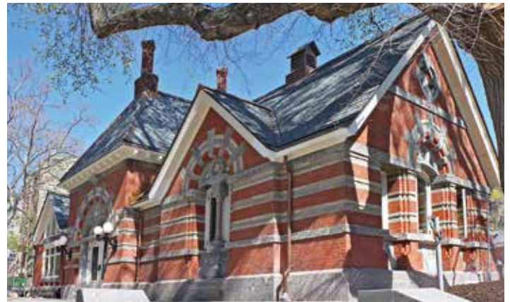
Tavern on the Green, Central Park

The Kerwin Residence on the Upper West Side is an 1886 row house, designed by Rafael Gustavino, Sr. It is one of a row that was all painted red and white, but when the paint started peeling on this house, the owners were surprised to see a different palette emerge. After consultation with architects and Gustavino scholars, they undertook a plan to restore the façade, which features natural red brick and terra cotta with red mortar, buff-colored brick, light-green sandstone with matching mortar, light-green painted sheet metal, and a dark brownstone stoop. Now, the unpainted façade of the Kerwin residence stands out from the row, with elegant style.