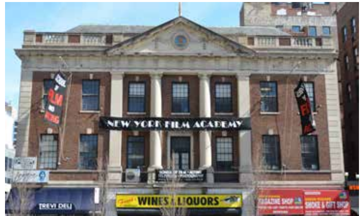
Tammany Hall, 100 East 17th Street, Manhattan

Conservancy staff testified against a proposed glass rooftop addition to Tammany Hall (100-102 East 17th Street). The 1929 neo-Georgian style edifice emphasizes balance and symmetry, and like other civic buildings of its era was built to recall the founding days of the Republic. The proposal would remove intact historic fabric at the original slate roof, which is part of the architectural composition of the building. The new dome would be highly visible from many vantage points and would treat the landmark as its base, altering the proportions of this classical structure. The Commission approved the proposal with modifications that decreased the dome.