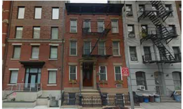
231 West 20th Street (middle), Manhattan

This is an unusually well preserved double-width townhouse originally dating to the 1830's with certain improvements, such as front doors and cornice, dating to the 1880's. The same family has owned the house since the 1920's. It has no landmark protection. Throughout the twentieth century, it was sub-divided into eight single-room-occupancy (SRO) apartments. Today it is home only to the 91-year-old owner who lives on the first and second floors. The balance of the house is empty. The owner has no direct heirs and wishes to protect the future of the house. Its designation as an individual landmark is unlikely, and given its less than perfect condition, it is not a good candidate for a preservation easement. However we advised the owner to place a restrictive covenant on the title of the house prohibiting its demolition in perpetuity. We are currently advising the owner and his lawyer on this process.