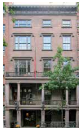
The Players, 16 Gramercy Park South

Years of deterioration had led to precarious conditions at The Players , the home of the Players Club on Gramercy Park. The Stanford White-designed brownstone façade and portico were crumbling; wood windows, ironwork, and stained glass were also failing. New brownstone was sourced and carved; the stained glass carefully removed from the frames and repaired off-site; and the wood windows and cornice restored. Research revealed a decorative floral motif at the brownstone capitals and a historic paint scheme that had once been lost and were both re-established.