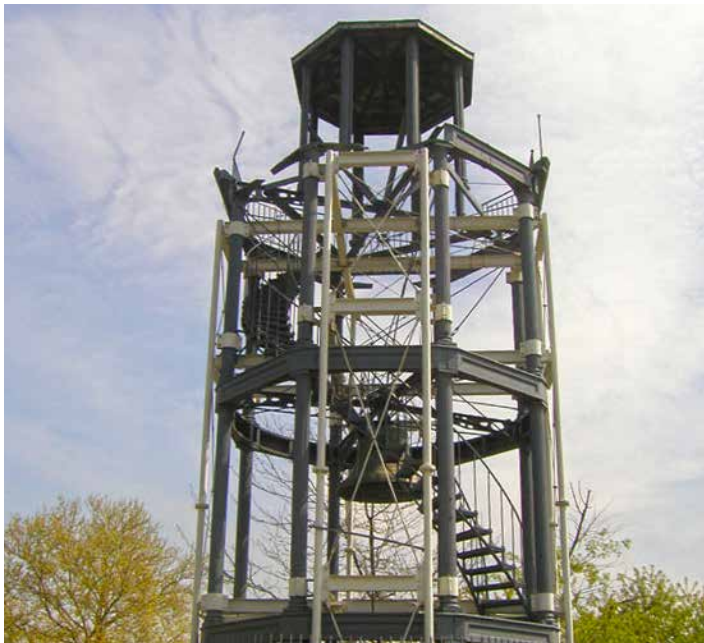
Fire Watchtower, Marcus Garvey Park, Manhattan