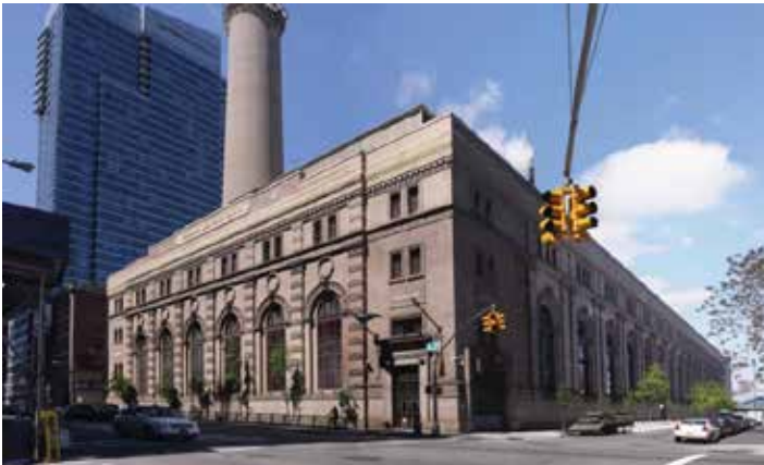
IRT Powerhouse, 59th Street and Eleventh Avenue, Manhattan