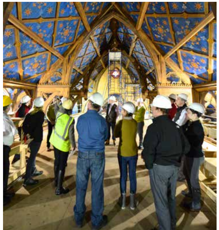
A hard hat tour of restoration work at Grace Church in Brooklyn Heights.