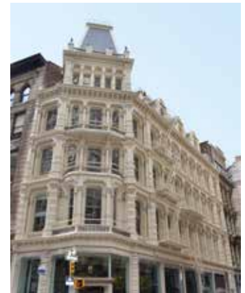
901 Broadway, Manhattan