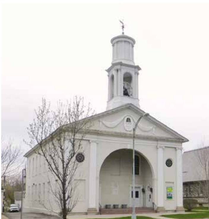
First Congregational Church of Canandaigua, New York