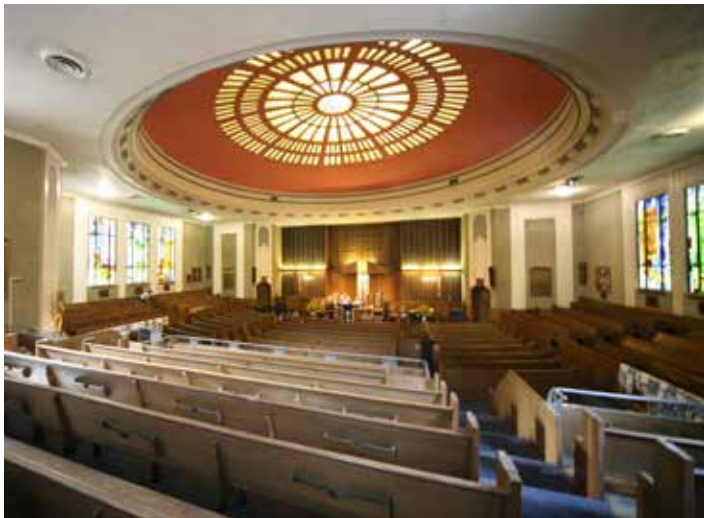
Hebrew Tabernacle, New York