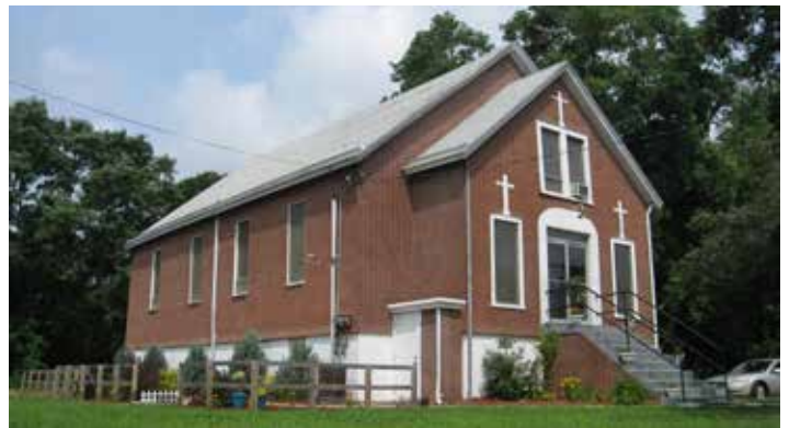
Rossville A.M.E. Zion Church, Rossville, Staten Island

With the support of the Rossville A.M.E. Church, which owns the cemetery, the Conservancy applied to the Richmond County Savings Foundation for funding to help underwrite a Cultural Landscape Report (CLR) for the cemetery. The CLR, which will be prepared by the firm of Jablonski Building Conservation (JBC), would consolidate all extant research on the site, oversee a ground penetrating radar initiative below the surface to ascertain locations of graves that are not (or have never been) marked, establish marker conservation priorities, recommend a landscape program for the grounds, and set forth a treatment plan for preserving and managing the cemetery in the future. Richmond County Savings Foundation awarded the Conservancy a grant of $18,000 toward the CLR, and a City Ventures Fund grant of $5,750 was authorized to fund the remainder of JBC’s services. Work on the project will begin in the spring of 2015.