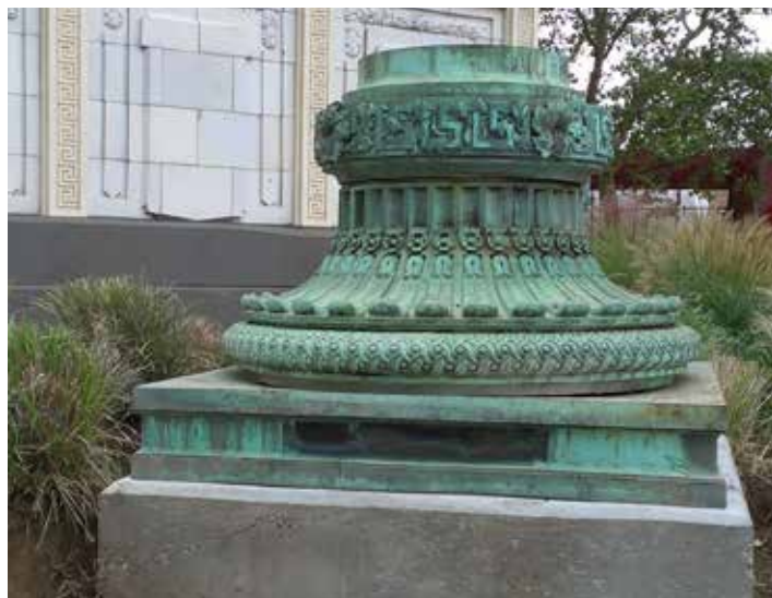
Roosevelt Island Lamppost Base, originally from the entrance to Queensboro Bridge