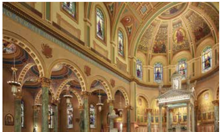
The Co-Cathedral of St. Joseph, 856 Pacific Street, Brooklyn