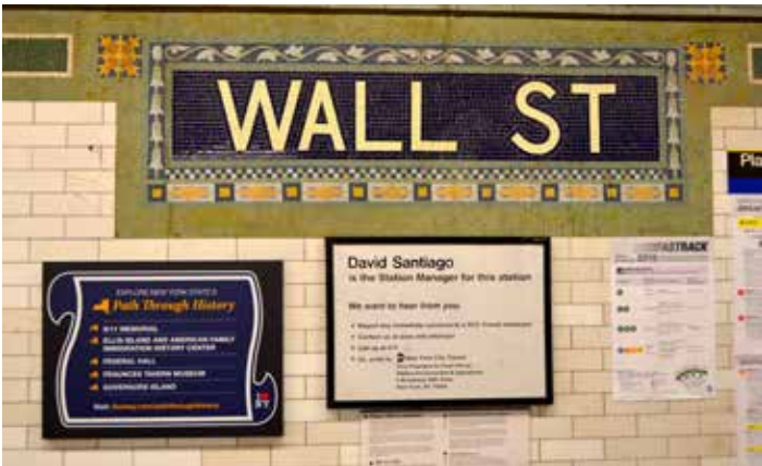
Path Through History Sign at Wall Street Subway Station

The New York City “Path Through History” social media campaign received more than 572,000 views. The City sites were also featured in releases that highlighted holiday events, special programming, and a photo contest. There was also a special “Path Through History” weekend in June.