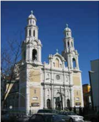
St. Barbara's RC Church, Bushwick, Brooklyn

A two story mid-19th-century wood frame cottage, sometimes described as the hunting lodge of a long vanished estate. It features board and batten siding and a graceful front porch.