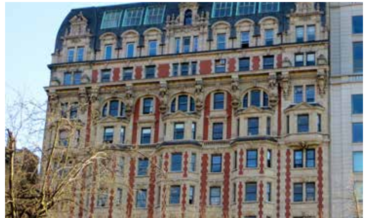
Chatsworth Apartments and Annex - 340-344 West 72nd Street, Manhattan

Conservancy staff testified on a proposal for alterations and additions to the Chatsworth Apartments and Annex (340-344 West 72nd Street) an individual landmark on the Upper West Side. We supported part of the proposal, which calls for restorative work, including window replacement and the installation of cresting at the Annex, which would match long-missing original fabric. We opposed large rooftop additions that would be highly visible from the street and nearby Riverside Park, and an expansion of the entryways that would introduce elements that did not complement the robust style of the building. The Commission approved the proposal.