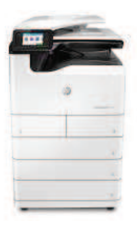
With 5 Trays & Exit Tray