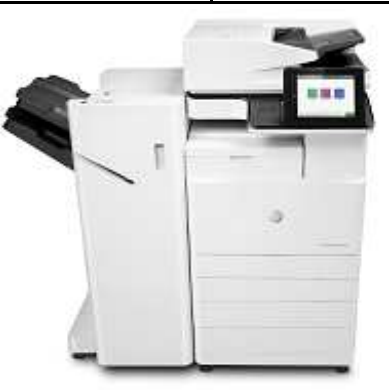
With Inner Finisher