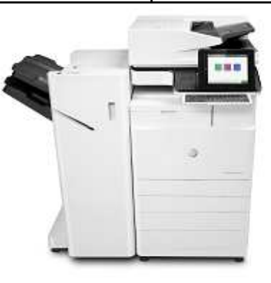
With Inner Finisher