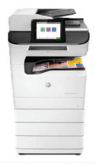
With 4 Trays, Keyboard & Internal Finisher