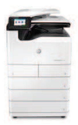
With 5 Trays & Exit Tray