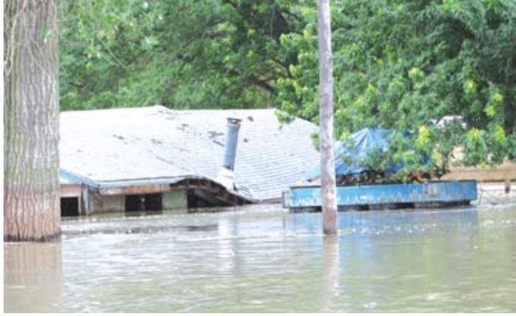
The roof on this home at Big Lake- Has apparently collapsed from floodwaters that have remained at Big Lake for the past six weeks. Despite the levels having dropped over a foot, as seen by the waterline on the tree at the left, several feet of standing water will continue to do more damage.