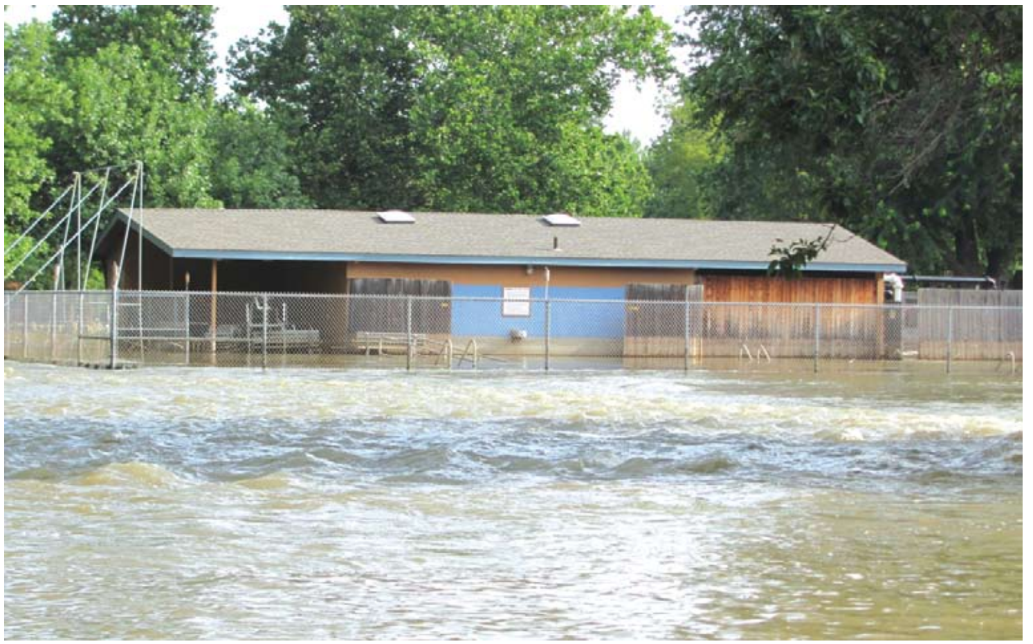
Visitors to the Big Lake State Park Pool- Would have to fight the current that still exists to the north and south of the pool. These areas still have a strong current, much like other areas all over the county.