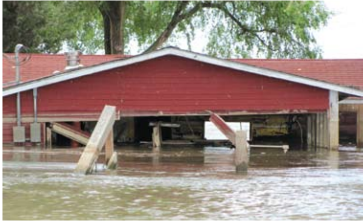
More evidence of the powerful destruction- Caused by the floodwaters at Big Lake. The walls of this home appear to have just disappeared. All windows and doors are gone as well.