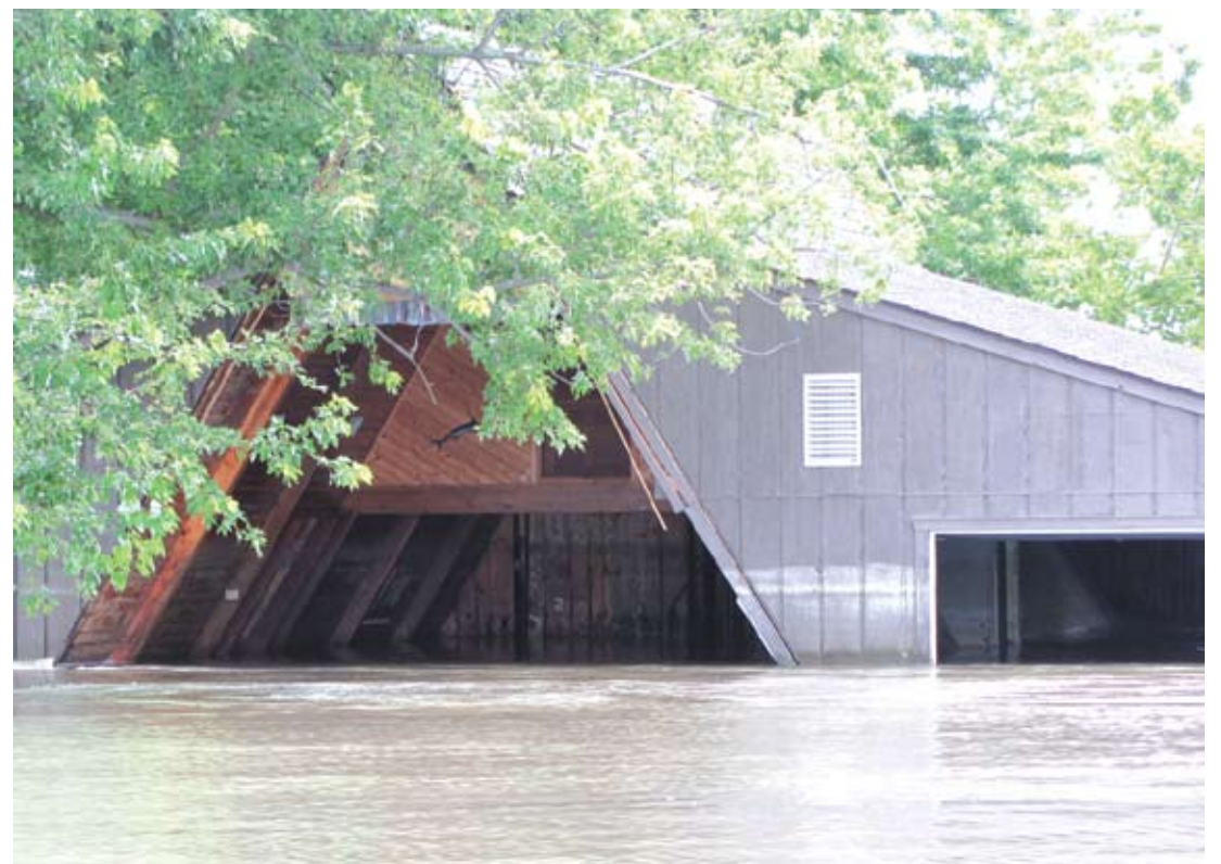
The back side of the home of Fred and Kim Kling- At Big Lake, MO, looks to have had the entire lake side wall torn away. The wood trim on the right side of the A-frame area appears splintered, testifying to the intensity of the 2011 floodwaters.