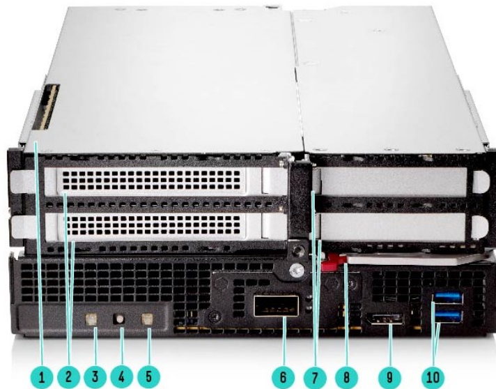
ProLiant e910 2U Blade Server - Front View