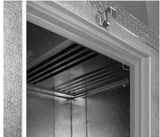
Top-mount refrigeration is flush to the interior.

Flush fit ceiling coil design allows full use of walk-in interior for storage. Top-mount self-contained refrigeration package significantly reduces refrigeration labor costs. Installation is quick and easy and can be completed without the services of a plumber or refrigeration technician. Plumbing is not required. Standard automatic condensate evaporator eliminates need for a drain line on indoor units. Plug and play design. Available in cooler, freezer, or combination cooler/freezer. Now available in 3/4 HP freezer. Top or side-mount refrigeration package configuration. New Roof-curb Technology allows for trouble-free outdoor installation. Refrigeration package is wired and run-tested at the factory.