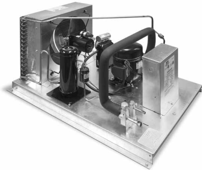
Weatherproof housing included

The RDI "PR" system is designed to allow for remote location of the condensing unit in applications where pre-charged lines would be difficult to run or the distance between the evaporator and the condensing unit is too great for pre-charged lines. All components are installed and wired, but the system contains only a holding charge of dry nitrogen. Installation involves securing the evaporator assembly on the interior of the walk-in and the condensing unit in a suitable location. Refrigerant lines must be run between the evaporator assembly and the condensing unit assembly. The system must be leak checked, evacuated and charged with refrigerant. The electrician must bring power to both the condensing unit assembly and the evaporator assembly. On low temperature systems the time clock is shipped loose and is to be field installed in a convenient location outside the walk-in.