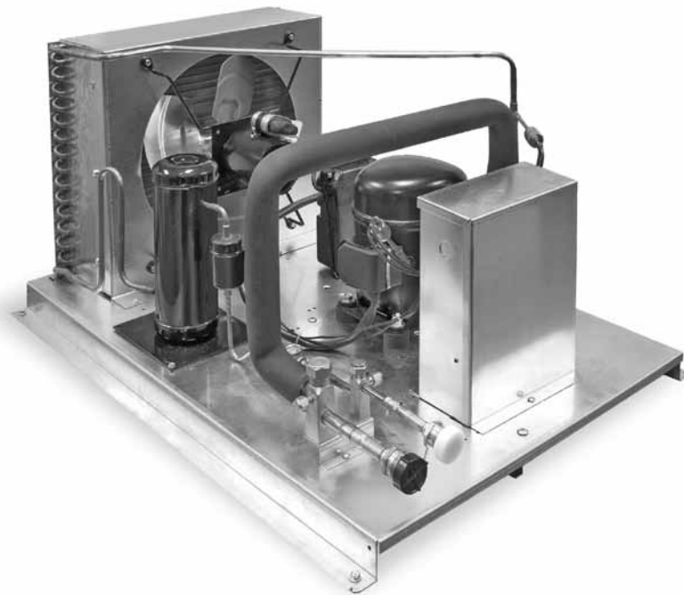
Weatherproof housing included

The RDI "PCL" system is supplied completely charged and tested. The condensing unit assembly is designed to be remotely located. Installation involves securing the evaporator assembly on the interior of the walk-in, locating the condensing unit in a suitable area near the walk-in, and running the pre-charged refrigerant lines between the condensing unit assembly and the evaporator assembly. An electrician must bring power to both the condensing unit assembly and the evaporator assembly. On low temperature systems the time clock is shipped loose and is to be field installed in a convenient location outside of the walk-in.