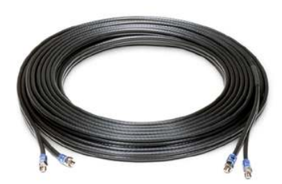
Table 10. Cisco Aironet Power Injector Cable Features