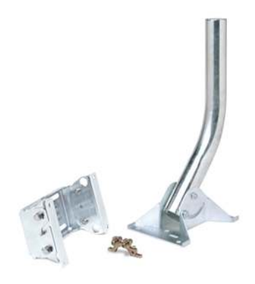
Table 11. Cisco Aironet 1400 Series Bridge Accessory Features