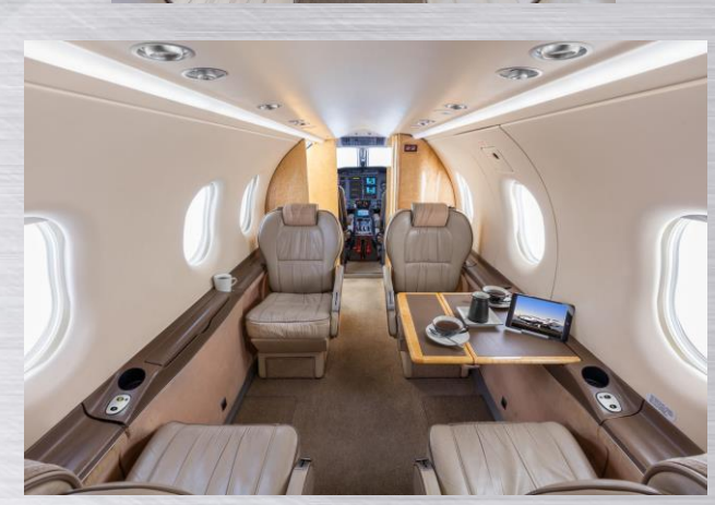
Call for Price

Verification of specification is the sole responsibility of Purchaser. Aircraft subject to prior sale and/or removal from market. Current as of 03/12/19.