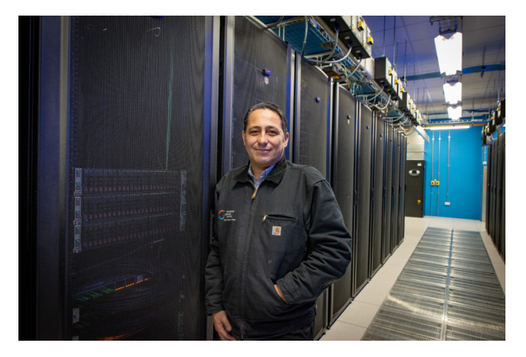
Customer testimonial on EcoStruxure IT Expert: https://youtu.be/UyAosCLvQDs