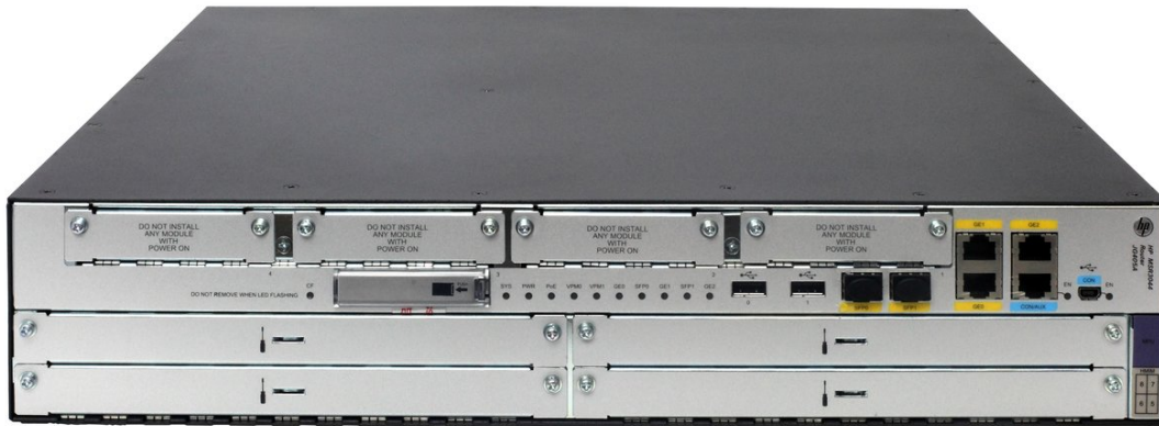
HPE FlexNetwork MSR3044 Router- Front