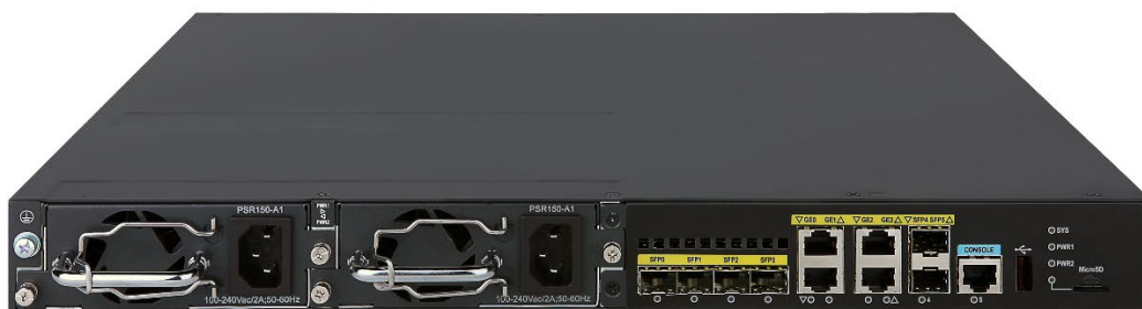
HPE FlexNetwork MSR3620-DP Router – Front