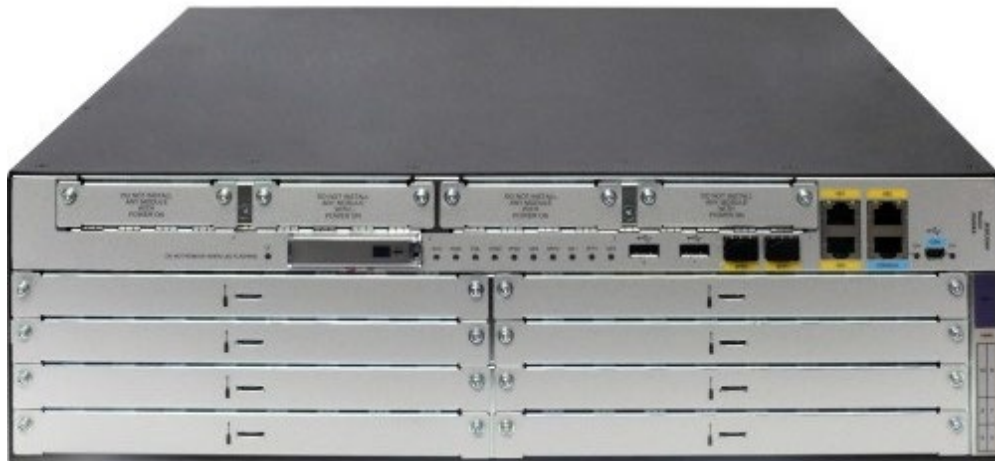
HPE FlexNetwork MSR3064 Router – Front