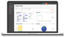
TEOS Manage licenses TEM-CO10 TEM-MR10 TEM-DS10