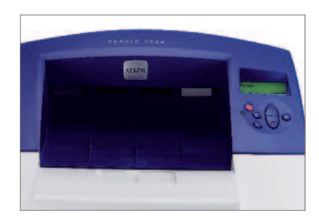
The Phaser 3600 laser printer's front panel.

The Phaser 3600 laser printer includes print drivers for PostScript® 3™ and PCL® 6 and 5e emulations. Organised by tabs, the print drivers make job programming easy and intuitive. The most commonly used features are located on the default tab, with advanced features easily accessible when programming more complex jobs. The print drivers also provide bi-directional information such as system status, consumable status, job status, installed options and more.