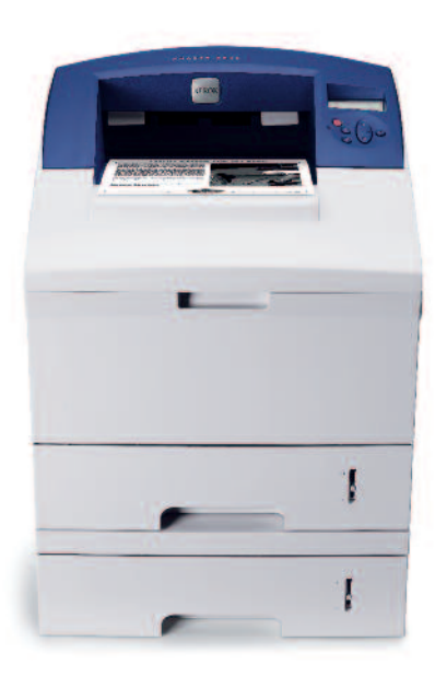
Phaser 3600 laser printer shown with optional 500-sheet Tray 3.

For longer periods of uninterrupted printing, consider increasing paper capacity by including an additional 500-sheet feeder, for a total paper capacity of 1,100 sheets.