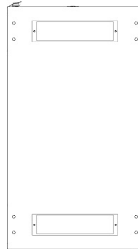
HP V142 Rack - top view