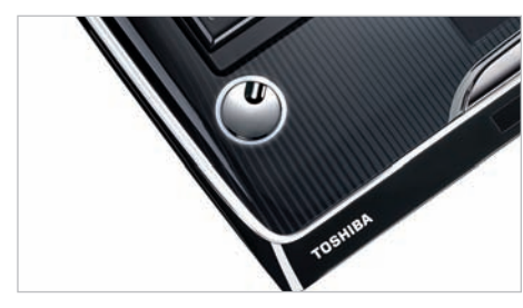
Toshiba's elegant 'Horizon' interior design and durable glossy 'Fusion' finish create a laptop that truly stands out from the crowd.