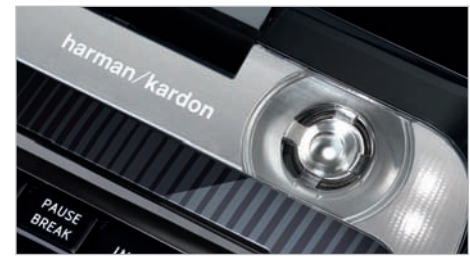
Harman Kardon® stereo speakers with subwoofer and Dolby® Sound Room™ generate a compelling soundscape for movies, music and games.