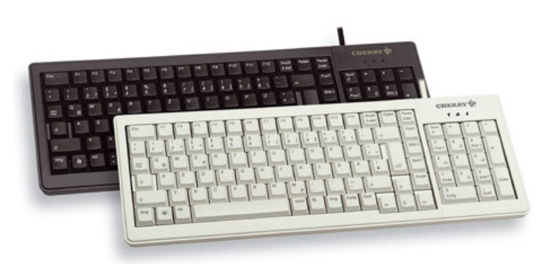
Models may vary from the image shown