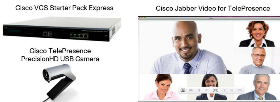
Figure 1. Cisco TelePresence Video Communication Server Starter Pack Express Bundle

The Cisco TelePresence ® Video Communication Server (VCS) Starter Pack Express is a feature-packed on-premises solution targeted to small and medium-sized businesses (SMBs) that are deploying a telepresence system for the first time. It allows these businesses to experience high-quality, enterprise-grade videoconferencing without spending a fortune on specialized equipment while providing a platform that allows for further infrastructure expansion (Figure 1).