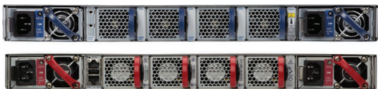
Figure 4. 7280R 1RU Rear View: Rear to Front and Front to Rear