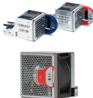
Figure 6. Hot-swappable fan modules