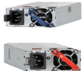
Figure 7. Hot-swappable power supplies