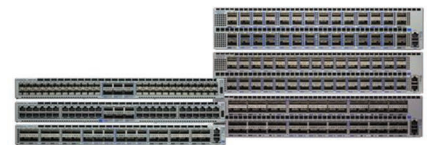
Figure 1. Arista 7280R Series

7280R support for 100GbE QSFP incorporates a flexible choice of interface speed including 25GbE and 50GbE providing unparalleled flexibility and the ability to seamlessly transition data centers to the next generation of Ethernet performance. The 7280R Series provide industry leading power efficiency with airflow choices for back to front, or front to back. An optional built-in SSD supports advanced logging, data captures and other services directly on the switch. Combined with Arista EOS the 7280R Series delivers advanced features for big data, cloud, virtualized and traditional designs.