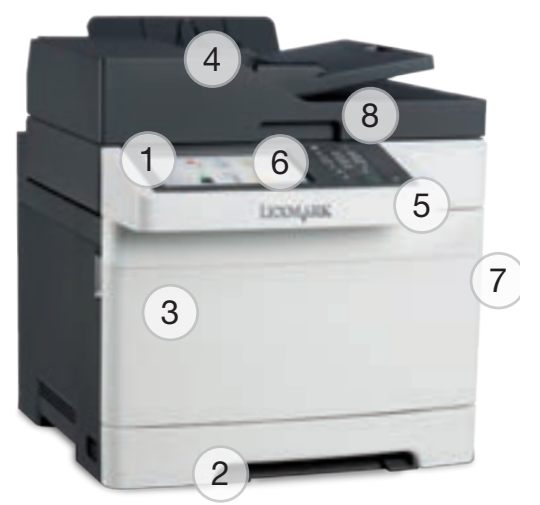
XC2132 with 7-inch colour touch screen