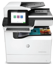
HP PageWide Managed Color Flow MFP E77660z