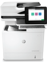
HP LaserJet Managed Flow MFP E62565h

This HP LaserJet MFP with JetIntelligence combines exceptional performance and energy efficiency with professional-quality documents right when you need them—all while protecting your network from attacks with the industry's deepest security. 1