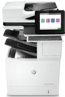
HP LaserJet Managed Flow MFP E62565z