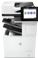
HP LaserJet Managed MFP E62565hs