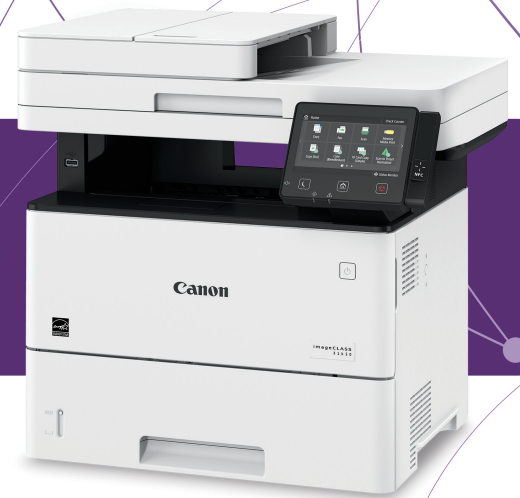
imageCLASS D1650 shown

Designed for small to mid-size workgroups, the imageCLASS D1650/D1620 balances speedy performance, minimal maintenance, and the ability to expand paper capacity for busy groups. A 5" color touchscreen delivers an intuitive user experience and can be customized by a device administrator to simplify many daily tasks. A legal-sized platen glass accommodates diverse scanning and copying needs.