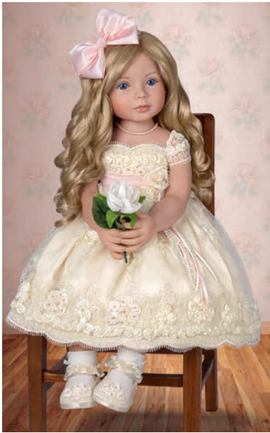
Satin ensemble adorned with over 200 faux pearls ▲ Pearls, Lace and Grace

This little lady is dressed to impress in a satin dress gleaming with more than 200 faux pearls. So lifelike, her crowning glory is her honey-blonde hair. Her cloth body is weighted , and her knees are bent so you can pose her in a small child's chair. (Chair not included; see ashtondrake.com for accessories). 28" with poseable arms. RealTouch vinyl.