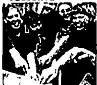
Empowering women and youth

For those seeking grant support, we invite letters of inquiry throughout the year from single organizations or collaborations among organizations. These letters can be up to three pages in length, should include