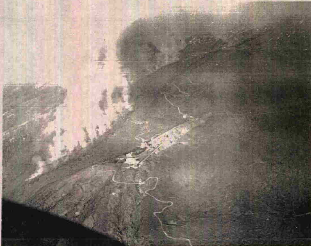
Hot lava making its own path down Mt. Vesuvius