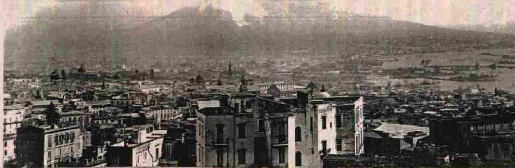
Naples and Naples harbor with Mt. Vesuvius in background