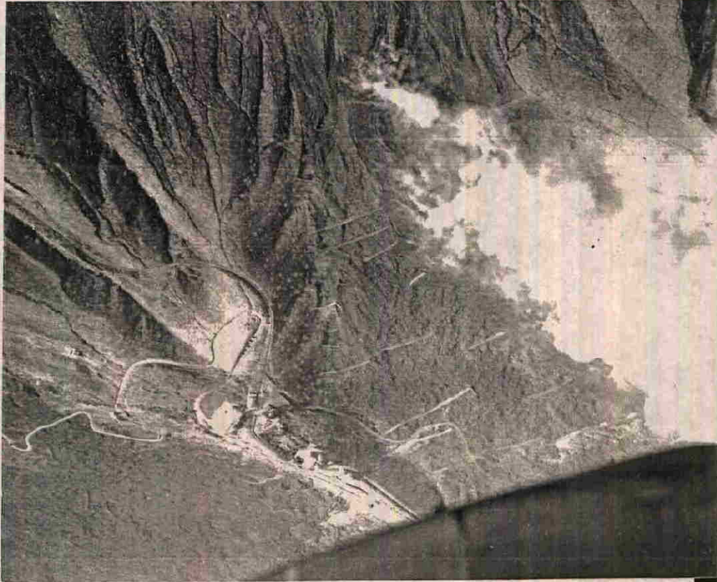
Retainer walls on side of Mt. Vesuvius