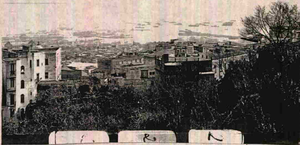
Naples and Naples harbor with Mt. Vesuvius in background