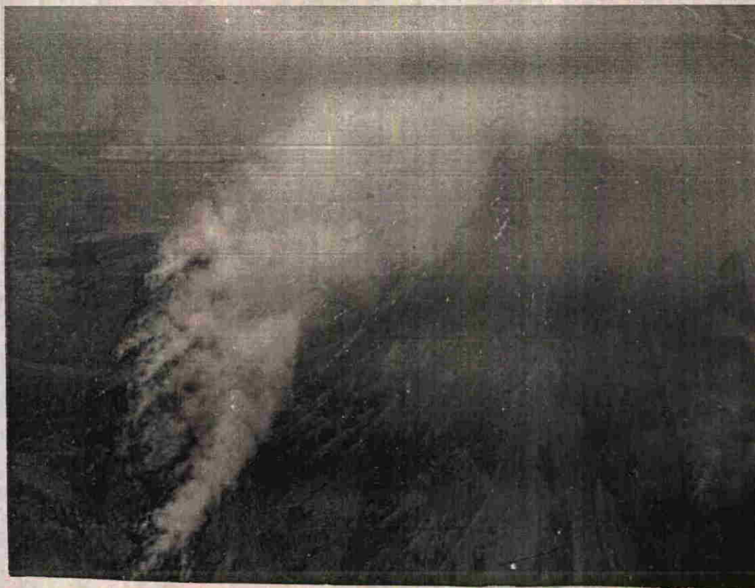
Lava flowing down Mt. Vesuvius