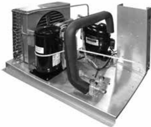
Weatherproof housing included

The RDI "PR" system is designed to allow for remote location of the condensing unit in applications where pre-charged lines would be difficult to run or the distance between the evaporator and the condensing unit is too great for pre-charged lines. All components are installed and wired, but the system contains only a holding charge of dry nitrogen. Installation involves securing the evaporator assembly on the interior of the walk-in and the condensing unit in a suitable location. Refrigerant lines must be run between the evaporator assembly and the condensing unit assembly. The system must be leak checked, evacuated and charged with refrigerant. The electrician must bring power to both the condensing unit assembly and the evaporator assembly. On low temperature systems the time clock is shipped loose and is to be field installed in a convenient location outside the walk-in.