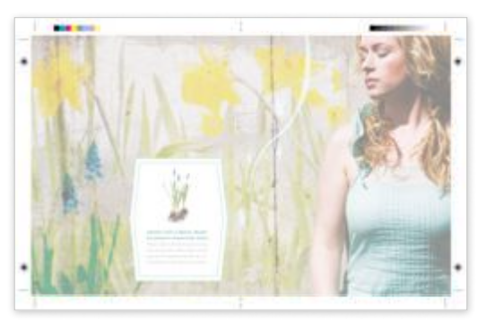
Oversize Output for A3 bleed

The Phaser 7800 colour printer gives graphic arts professionals an impressive range of business-ready finishing options to choose from. Depending on your needs and budget, you can go with the all-in-one Professional Finisher and get stacking, stapling, hole punching, booklet making and v-folding; or start with the Office Finisher LX and get stacking and stapling with the flexibility to add separate hole punching, creasing and stapling capabilities as your workload dictates.