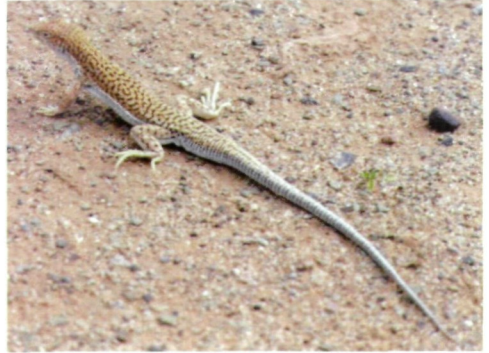
Fig. 1: Male Acanthodactylus scutellatus audouini BOULENGER, 1918 from west of Ouadane (Mauritania) (Photo: P. LLUCH).

In November 1995 one of the authors (PL) found and photographed a large male of Acanthodactylus scutellatus audouini BOULENGER, 1918 (fig. 1), east of Ouadane (ca. 20°59'N / 11°26'W), in the north-eastern Adrar area of Mauritania (fig. 2). This specimen can be identified undoubtedly as A. s. audouini by its large size, the strongly