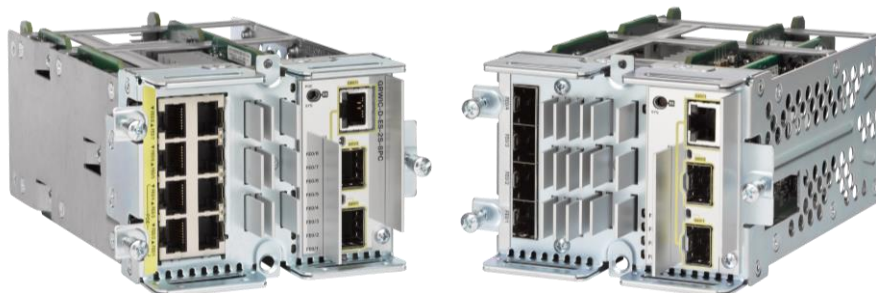
Figure 1. Cisco 2010 Connected Grid Router Ethernet Switch Modules (CGR 2010 ESM)

The Cisco Ethernet Switch Module (CGR 2010 ESM) (Figure 1) greatly expands the Cisco 2010 Connected Grid Router's capabilities by integrating industry-leading Layer 2 and Layer 3 (optional) switching with feature sets comparable to those found in the Cisco 2520 Connected Grid Switches ( http://www.cisco.com/go/cgs2500 ). The new Cisco Ethernet Switch Module along with the Cisco 2010 Connected Grid Router (CGR 2010) are designed specifically for use in connected energy applications such as grid automation, distributed generation, integrated renewable energy, trackside substations, and water, oil, and gas applications. The CGR 2010 ESM uses Cisco IOS® Software, which is the operating system powering millions of Cisco switches worldwide, and provides the benefits of improved security, network resiliency and reliability, and scalability.