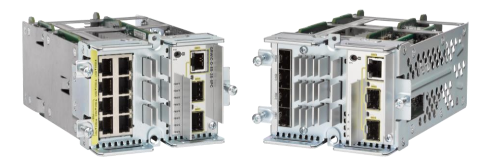
Figure 1. Cisco 2010 Connected Grid Router Ethernet Switch Modules (CGR 2010 ESM)

The Cisco Ethernet Switch Module (CGR 2010 ESM) (Figure 1) greatly expands the Cisco 2010 Connected Grid Router's capabilities by integrating industry-leading Layer 2 and Layer 3 (optional) switching with feature sets comparable to those found in the Cisco 2520 Connected Grid Switches (<a href="http://www.cisco.com/go/cgs2500">http://www.cisco.com/go/cgs2500</a>). The new Cisco Ethernet Switch Module along with the Cisco 2010 Connected Grid Router (CGR 2010) are designed specifically for use in connected energy applications such as grid automation, distributed generation, integrated renewable energy, trackside substations, and water, oil, and gas applications. The CGR 2010 ESM uses Cisco IOS® Software, which is the operating system powering millions of Cisco switches worldwide, and provides the benefits of improved security, network resiliency and reliability, and scalability.