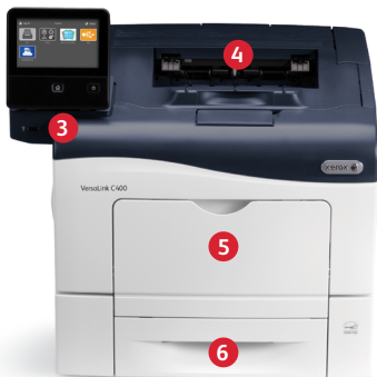
Xerox® VersaLink C400 Color Printer Print.