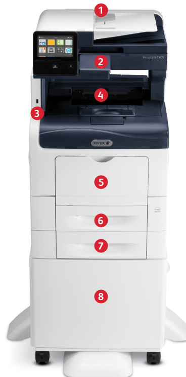
Xerox® VersaLink C405 Color Multifunction Printer Print. Copy. Scan. Fax. Email.