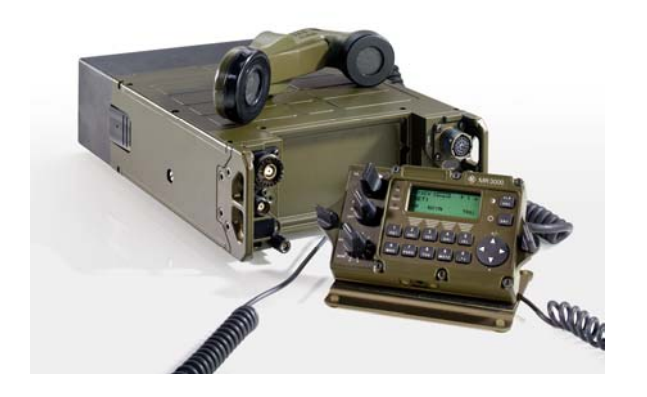
Fig. 5: R&S<sup>®</sup>M3TR (Multiband, Multimode, Multirole Tactical Radio)

The R&S<sup>®</sup>M3TR offers high data rates of up to 72 kbps for real-time data and video transfer as well as an Internet/Intranet access via the integrated Ethernet interface.