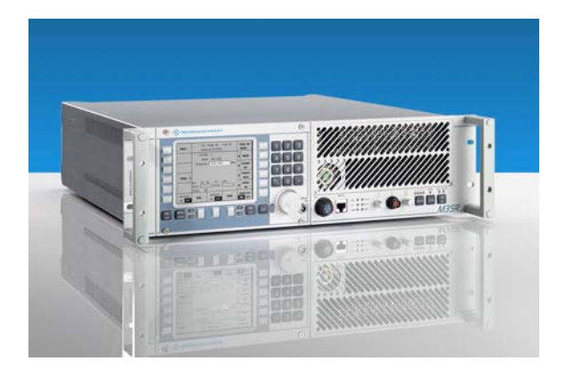
Fig. 3: R&S<sup>®</sup>M3SR (Multiband, Multimode, Multirole Stationary Radio)

embedded COMSEC functionality), NATO-Have Quick I/II and NATO-SATURN.