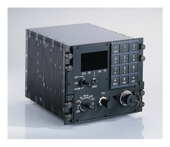
Fig. 1: R&S<sup>®</sup>M3AR (Multiband, Multimode, Multirole Airborne Radio)

The radios of the R&S<sup>®</sup>M3xR family are based on the same technology platform. It uses similar processor families for the respective tasks within the radio, e.g. human-machine interface (HMI), radio control, digital signal processing, and protection processing units as far as this is viable. The technology platform provides an architectural framework that is comparable to the Joint Tactical Radio System/Software Communications Architecture (JTRS/SCA) and eases the scalability of the radio and the portability of software functions across the